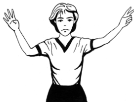
HOLD UP NUMBER OF PLAYER