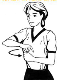
ROTATE FINGER WIPE OUT BASKET