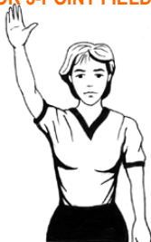
OFFICIAL WILL RAISE ONE ARM ON ATTEMPT