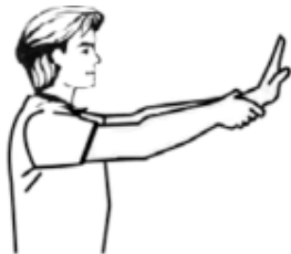
ARM STRAIGHT OUT OPPOSITE ARM GRABBING WRIST