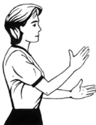
PATting MOTION CALL TEAM COLOR