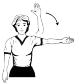
CHOP HAND TO SIDE