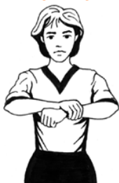
SIGNAL FOUL: GRASP WRIST