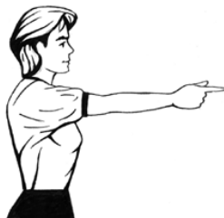
POINT - DIRECTION CALL TEAM COLOR