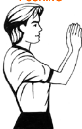
SIGNAL FOUL: IMITATE PUSH