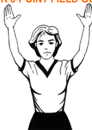
IF THE GOAL IS SUCCESSFUL RAISE THE OTHER ARM