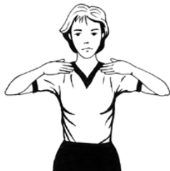
TOUCH SHOULDERS WITH HANDS