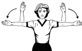
EXTEND ARMS TO SHOULDER LEVEL