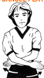
SHIFT ARMS ACROSS BODY