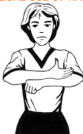
SIGNAL FOUL: STRIKE WRIST