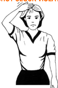
TAP HEAD SIGNAL