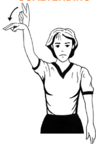
FLAG FROM WRIST