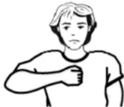
ARM BENT 90 DEGREES IN FRONT OF BODY