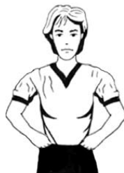
FISTS ON HIPs