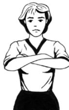
ARMS OUTSTRETCHED AND CROSSED IN FRONT OF CHEST