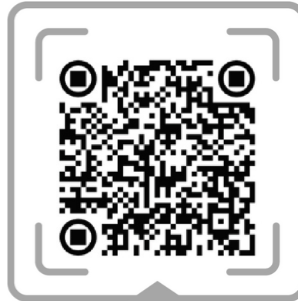
AMBER Alert resources