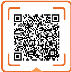
Indian Country (AICC) courses