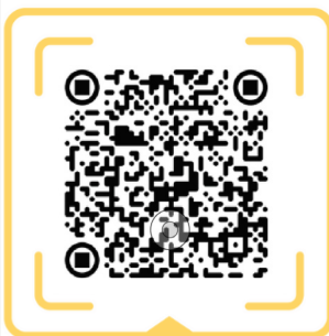
Find AMBER Alert partners