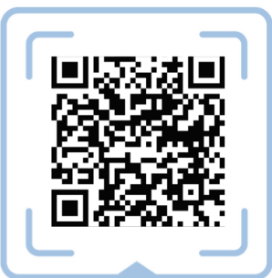
Family Survival Guide

Trusted, timely, & actionable information—at your fingertips.