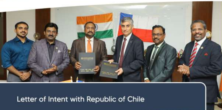
Letter of Intent with Republic of Chile