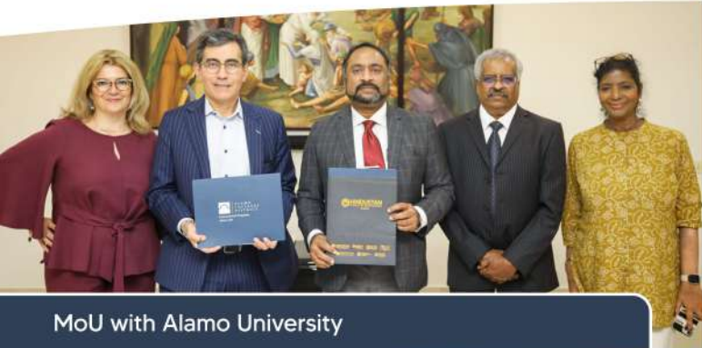
MoU with Alamo University