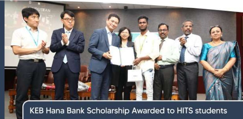
KEB Hana Bank Scholarship Awarded to HITS students