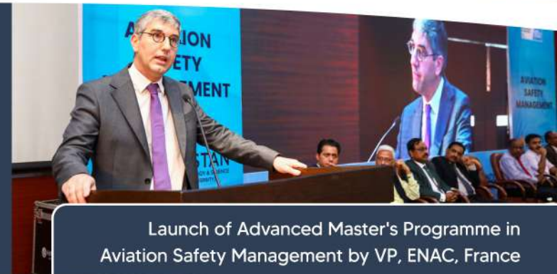
Launch of Advanced Master's Programme in Aviation Safety Management by VP, ENAC, France

150+ MoUs across 35 countries for student and faculty exchange