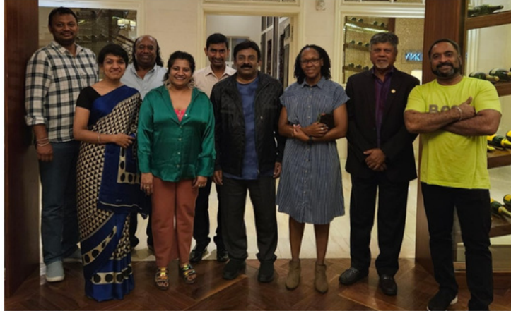
Patrons of HGI meet the alumni in Nairobi, Kenya on 14 Jan 2024. Alumni were delighted to greet the esteemed guests from their Alma mater.