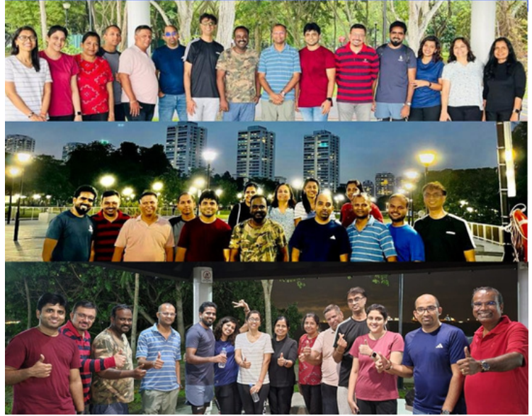
HEAAC HAD BICYCLING & WALKING EVENT AT EAST COAST PARK, SINGAPORE ON 25 NOV 2023.