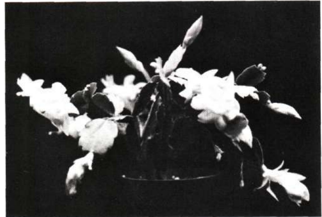
The holiday cacti as it should appear when ready for market.