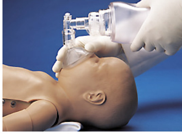
Figure 1: Example of immediate manual resuscitation recommended for a severely asphyxiating infant