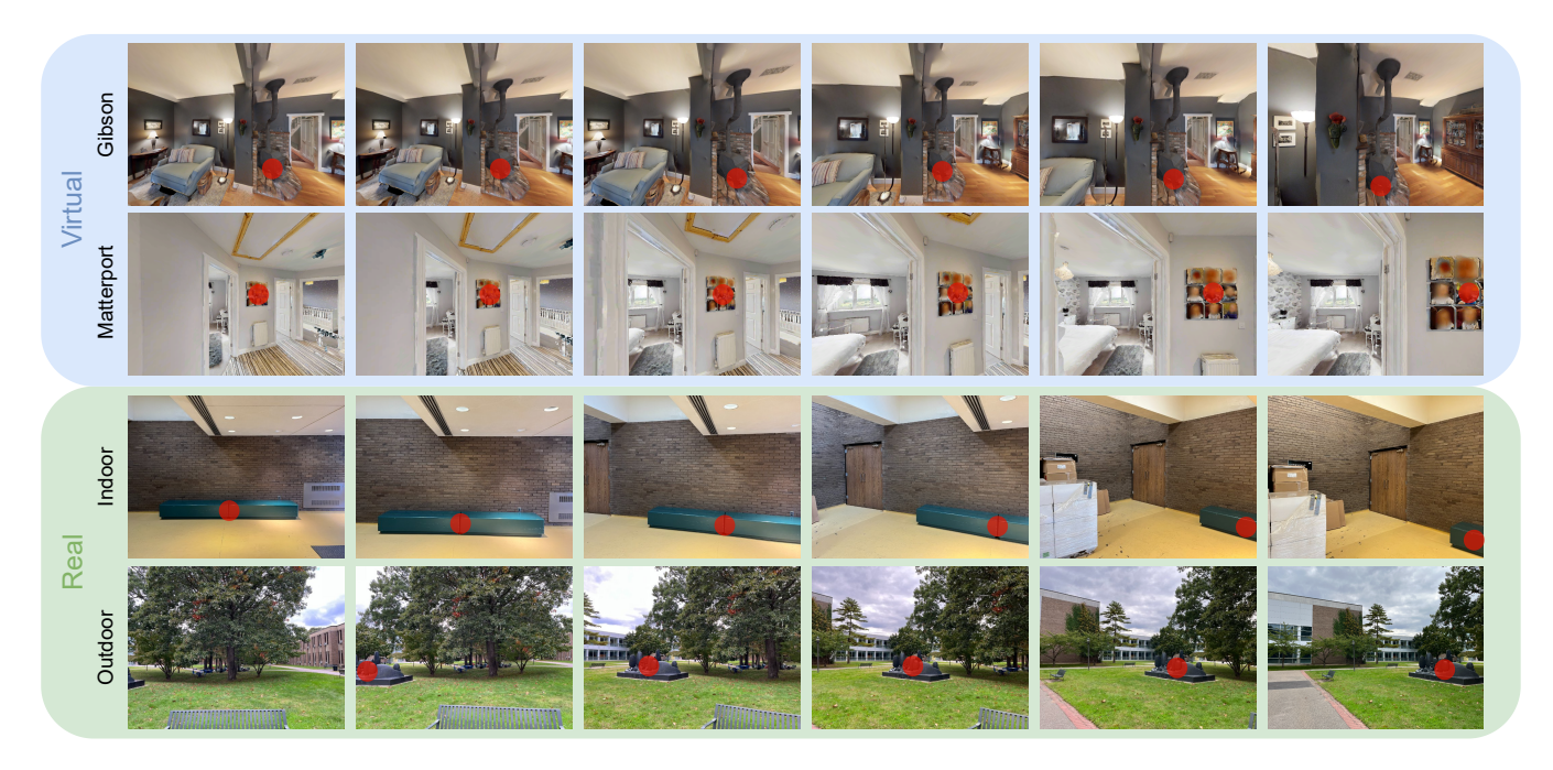
Figure 2: Samples of RGB images in our dataset captured from an ego-centric camera. Video frames start from left to right. Landmarks are visualized with red dots. Samples in the virtual dataset (1st and 2nd rows in blue) are visually realistic compared to the real-world observations (3rd and 4th rows in green), which makes landmark data acquisition scalable to serve real-world research purposes.