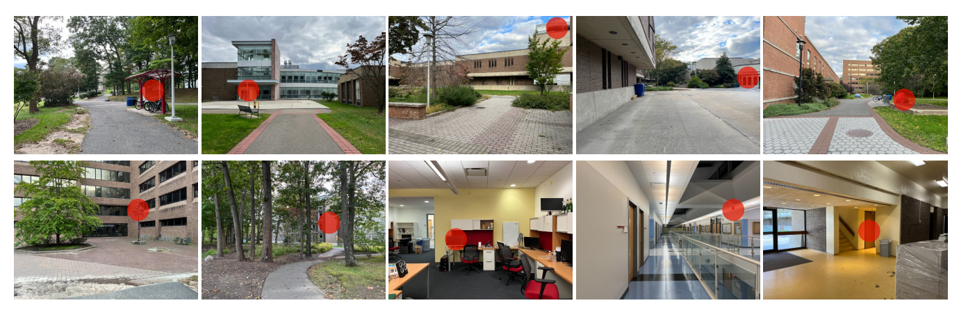
Figure 3: Samples of RGB images in the real world environments with landmarks annotated by red dots. Trajectories are recorded in comprehensive environments both indoors and outdoors.