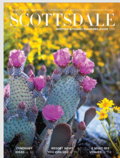
Meeting & Travel Planners Guide