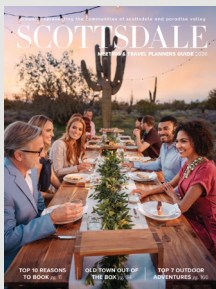
Meeting & Travel Planners Guide