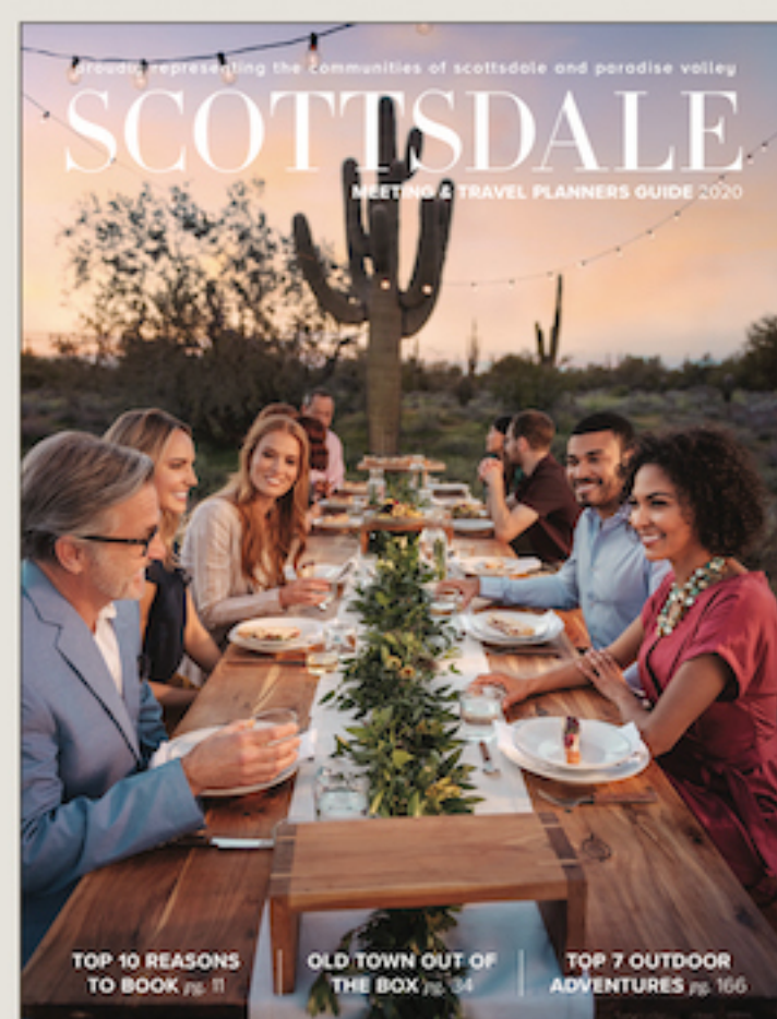
Meeting & Travel Planners Guide