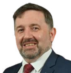
ROBIN SWANN South Antrim