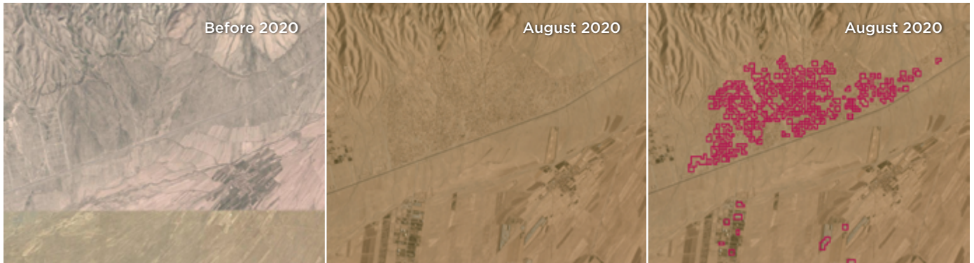
New city next to Herat, Afghanistan

Defense & Intelligence: Update your base layers every month