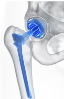
Orthopedic joint replacements

Alumina has been widely used in medical applications for decades. It has excellent biocompatibility (suitable for use inside the human body) and has been proven to be safe for dental implants, orthopedic joint replacements and more. Alumina is also utilized in products that go on the outside of the body as well, being used as an abrasive, anti-caking agent and opacifying agent in cosmetics such as sunscreen, blush, lipstick and more.