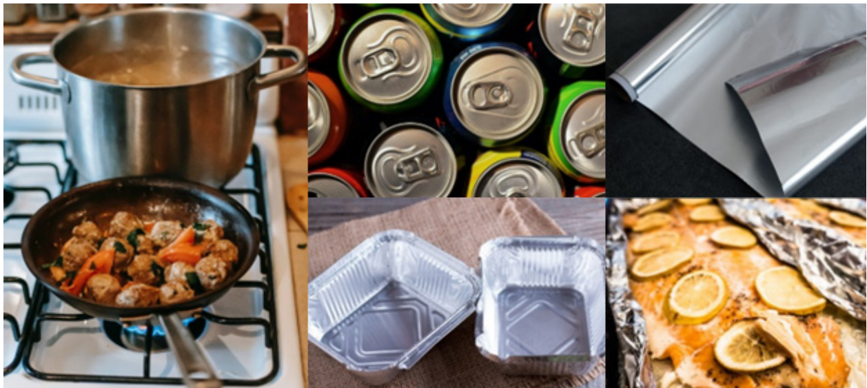
Aluminum comes into contact with many things we eat or drink every day via cooking pans, beverage cans, foil and food storage.

Aluminum is reactive and is never found in raw form; rather, it is found in compound form such as potassium aluminum sulphate or aluminum oxide (which must be further refined to release pure aluminum). Pure aluminum is soft and relatively weak (example: aluminum foil, which is greater than 98% pure aluminum) so it is often alloyed with other elements such as copper, zinc or magnesium to give it greater strength. Aluminum is used as a structural component in many industries and consumer products, including aerospace, automotive, electronics, building construction, and medical applications as well as many food service products such as pots and pans, aluminum foil, beverage cans and more.