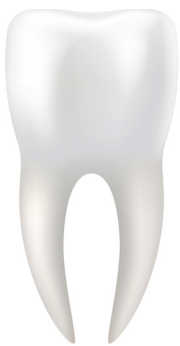
Alumina in dental applications

Alumina has been widely used in medical applications for decades. It has excellent biocompatibility (suitable for use inside the human body) and has been proven to be safe for dental implants, orthopedic joint replacements and more. Alumina is also utilized in products that go on the outside of the body as well, being used as an abrasive, anti-caking agent and opacifying agent in cosmetics such as sunscreen, blush, lipstick and more.