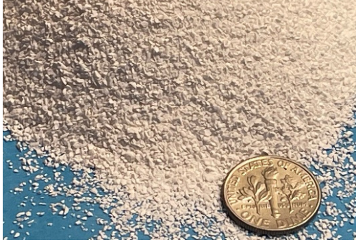
Activated alumina shown in the form of a fine, adsorptive powder as found in our Berkey PF-2® Fluoride and Arsenic Reduction Element media