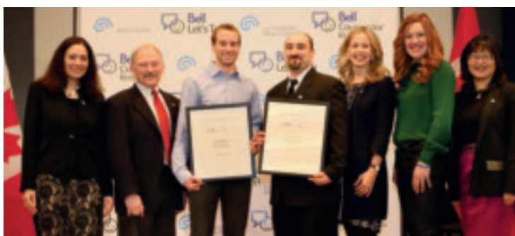
On February 8th, 2013, the Bell Mental Health Research Training Awards were announced in Vancouver, BC.