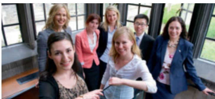
On May 8 th , 2013, Bell and Brain Canada recognized the Ontario-based recipients of the Bell Mental Health Research Training Awards.