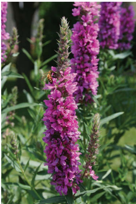
Purple loosestrife ( Lythrum salicaria )

Despite their different interests, partners may be able to agree on a common concern, such as a particular invasive species (e.g. garlic mustard) or group of species (e.g. woody invaders of forests), protection of a treasured natural area, or a pressing issue like early detection of new invaders. Alternatively, the group may agree on a desired outcome (e.g. improved bird habitat, clear hiking trails, native plant restoration) and then work backwards to determine what actions are necessary to achieve that vision. Talk to neighbors and community leaders about invasive plants to find out which issues you all agree on. Focus on at least one common concern or shared vision to initiate a CWMA.