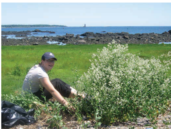
Early detection of perennial pepperweed ( Lepidium latifolium ) by the Coastal Watershed Invasive Plant Partnership of New Hampshire.

It is important to monitor the effectiveness of projects. For instance, did the Volunteer Invasive Plant Control Day significantly decrease the garlic mustard in the area? In addition to weed population and control efforts, the desired natural community should be monitored as well. Fo-