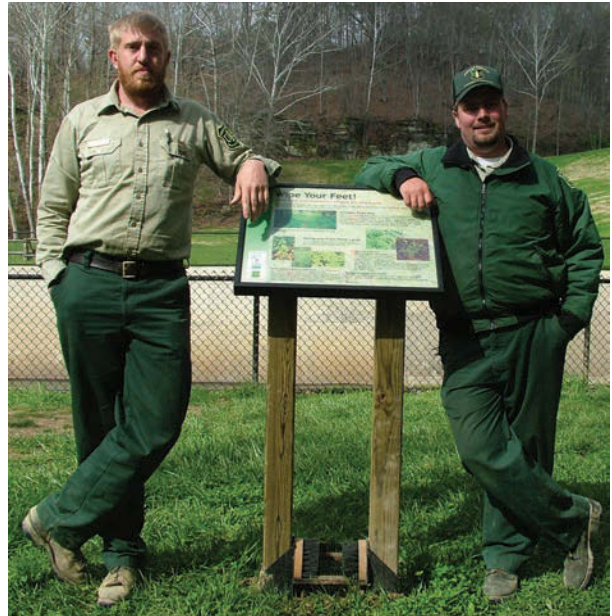
A boot brush station at the entrance to a natural area will help keep invasive species out when used properly and consistently.

Prevention is by far the most cost-effective strategy when it comes to invasive species. Working to stop the introduction and spread of invasive plants in your CWMA should be a priority.