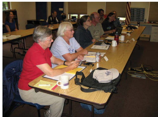
Training volunteers on mapping and data sharing in Wisconsin.

The steering committee may also appoint a vice-chairperson to assist with leadership and administrative tasks or other officers as necessary.