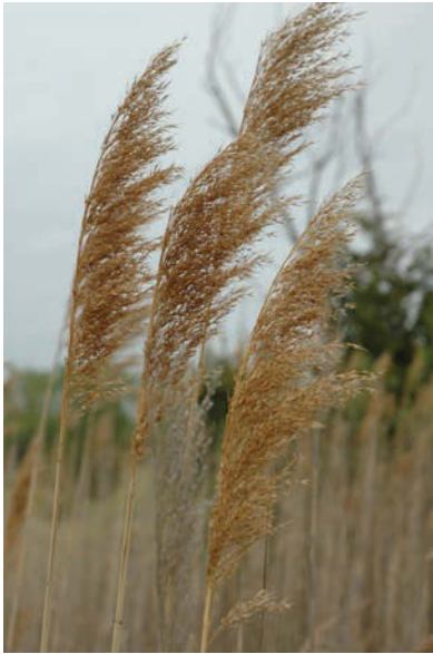
A common reed ( Phragmites australis ) task force could be a possible focus of a standing committee.