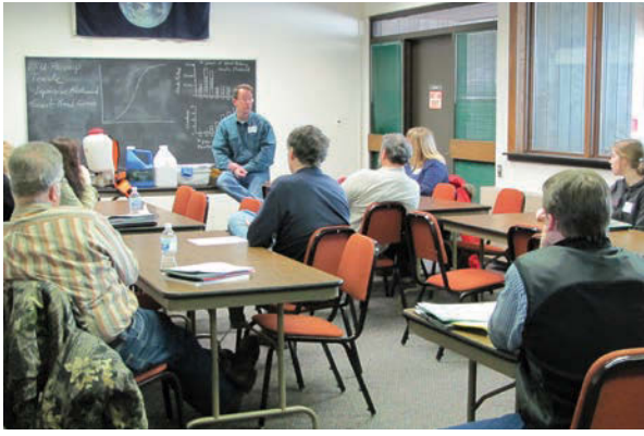
Meeting of the Southeast Wisconsin Invasive Species Consortium.