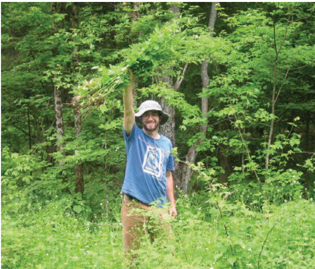
Volunteer pulling garlic mustard for the Adirondack Invasive Plant Project, New York.