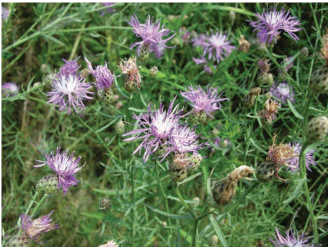
Spotted knapweed ( Centaurea maculosa)

Many government agencies will have small amounts of money available at the end of their fiscal year to be spent on invasive species programs, and CWMA's are well-suited to receiving small pots of money for on-the-ground control work. To avoid arguments over which partner's land is the highest priority for control work when unexpected funds become available and need to be spent quickly, make sure you have prioritized projects ahead of time. Creating a strategic management plan and an annual operating plan will help avoid these sorts of issues.