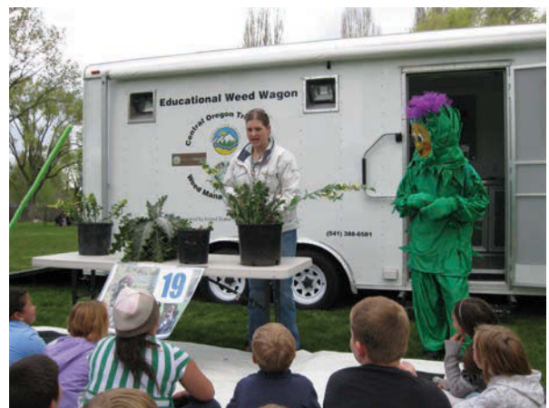
Educational Weed Wagon presentation, Crooked River WMA, Oregon.

Raising awareness about invasive plants within a community is one of the most important functions of a CWMA. Here are a few examples of projects that CWMA have used to educate a wide variety of audiences.