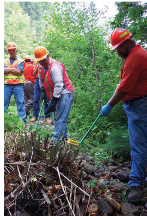
Using cut-and-swab treatment to control Japanese knotweed, Adirondack Park Invasive Plant Program, New York.

Many local communities have established informal partnerships to work with others to manage invasive plants. However, the formal agreement created to form a Cooperative Weed Management Area establishes a long-term relationship and a mechanism for ongoing resource sharing.