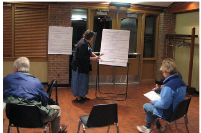
Partners gather for a meeting of the West Michigan Cluster of The Stewardship Network.

The steering committee organizes members, establishes priorities, develops strategic management and annual operating plans, documents progress, and reports on goals accomplished by participants. This group provides direction, identifies opportunities, and generally furthers the common goals of the CWMA.