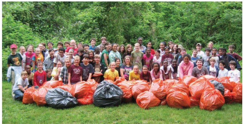
A garlic mustard pull event for K-12 students organized by the River to River CWMA.