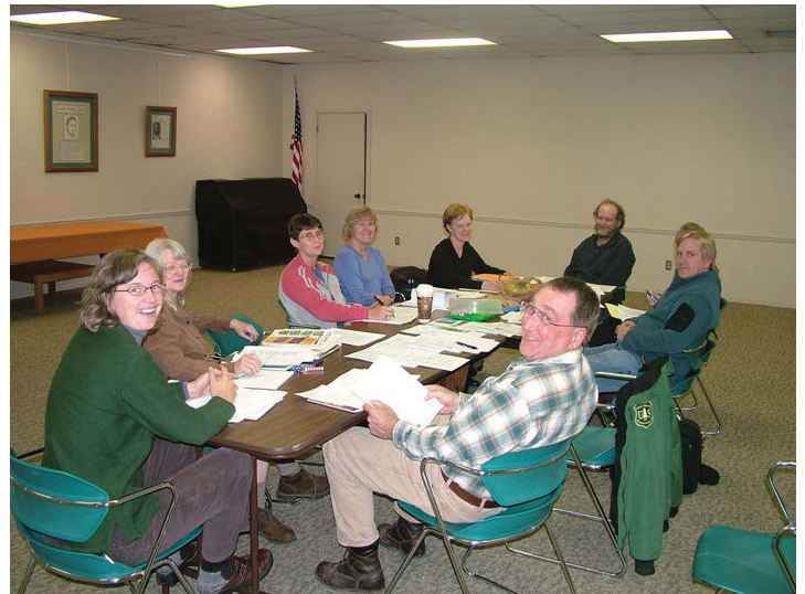
Ohio’s Iron Furnace CWMA Steering Committee hard at work.

For examples of an MOU and a Hold Harmless Agreement, see www.mipn.org .