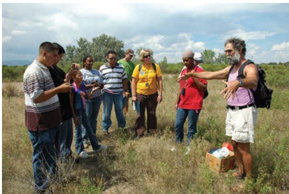
The ability to bring people together and good communication skills are important in a champion.

A key element to the success of a CWMA is finding someone who is excited about cooperative weed management to lead the group as it forms. This leader or champion should have enthusiasm, commitment to creating a successful organization, and the time and ability to motivate others to participate. The main tasks of the champion are to invite potential partners, organize and run meetings, make calls, move the group toward organization, and follow up on action items (e.g. make sure agreements are reviewed and signed by all partner groups).