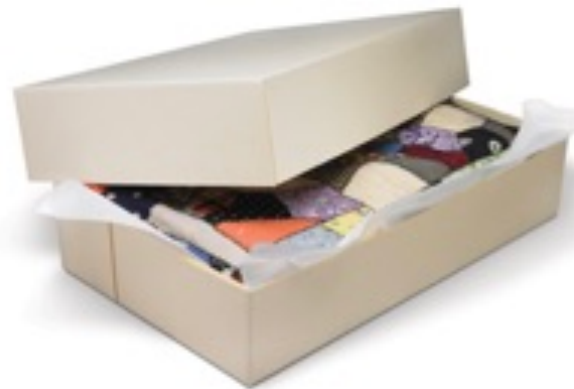
ACID-FREE TEXTILE STORAGE BOX

Dangers to all textiles include: light (both artificial and daylight), dirt, dampness, insects, and excessive heat.