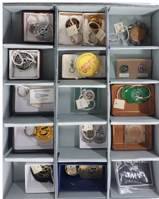
SMALL OBJECTS BOX