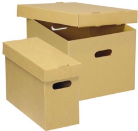
ACID-FREE DOCUMENT STORAGE BOXES