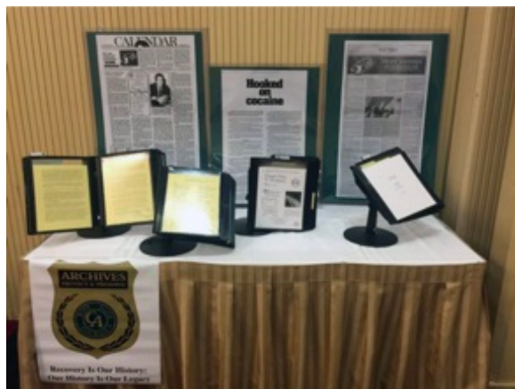
HISTORICAL FLIP BOOKS

https://museum.ca.org/wp-content/uploads/downloads/CAWS-History-Slide-Show.pdf