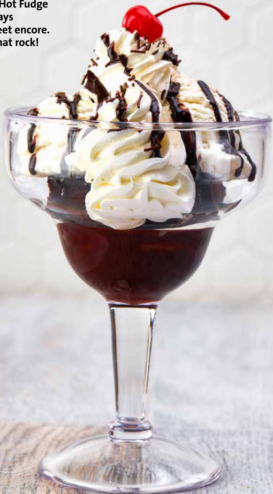
HOT FUDGE BROWNIE

From Milkshakes to Hot Fudge Brownies, nothing says rock n' roll like a sweet encore. Cheers to desserts that rock!