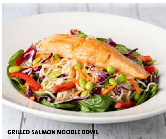
GRILLED SALMON NOODLE BOWL

We hold allergy information for all menu items, please speak to your server for further details. If you suffer from a food allergy, please ensure that your server is aware at the time of order. † Contains nuts or seeds. * These items contain (or may contain) raw or undercooked ingredients. Consuming raw or undercooked hamburgers, meats, poultry, seafood, shellfish or eggs may increase your risk of foodborne illness, especially if you have certain medical conditions. # (GF) Gluten-Free, (V) Vegetarian, (VG) Vegan. A These dishes can be modified for a Gluten-Free, Vegetarian or Vegan option. (GF-A) Gluten-Free available, (V-A) Vegetarian available, (VG-A) Vegan available. Please talk to your server to arrange any dietary needs. 2000 calories a day is used for general nutrition advice, but calorie needs vary. Additional nutritional information is available upon request.