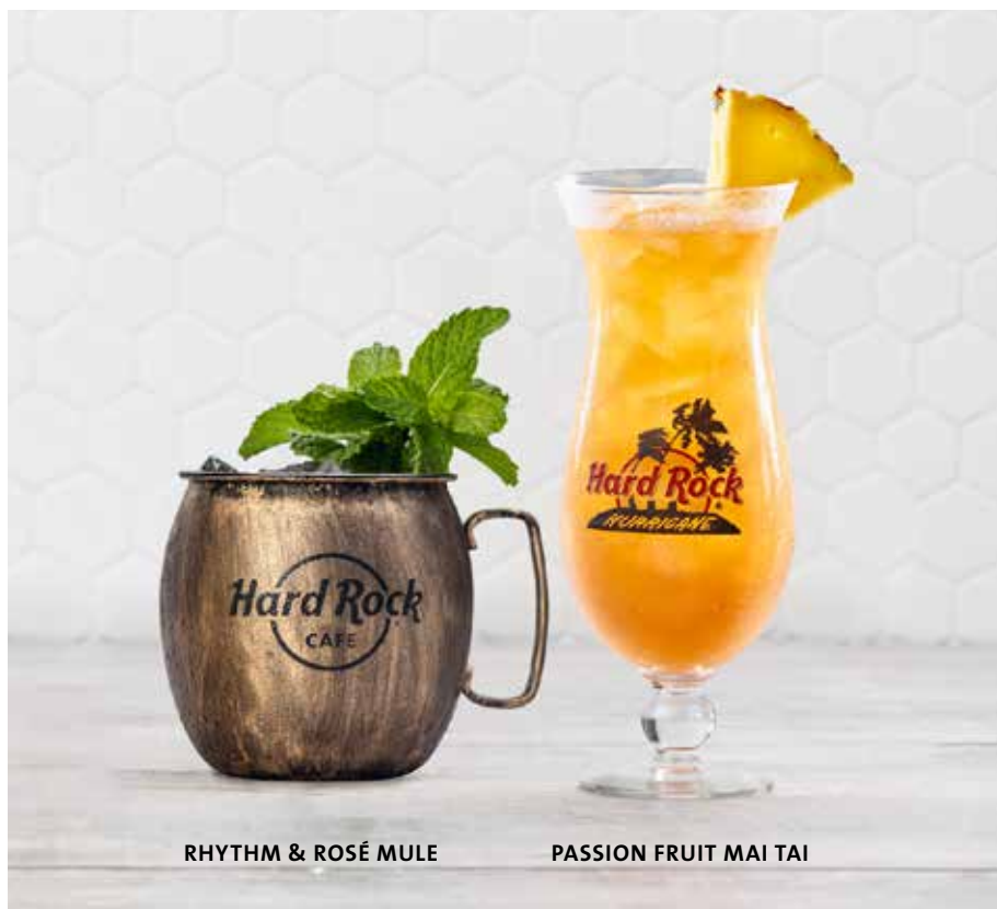
RHYTHM & ROSÉ MULE

Bacardi Superior Rum, Malibu Coconut, crème de banane, grenadine, pineapple and orange juice. £9.25