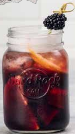
BLACKBERRY SPARKLING SANGRIA