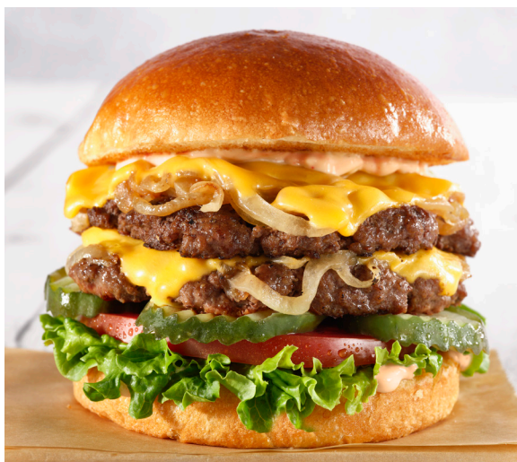
THE CLASSIC BURGER