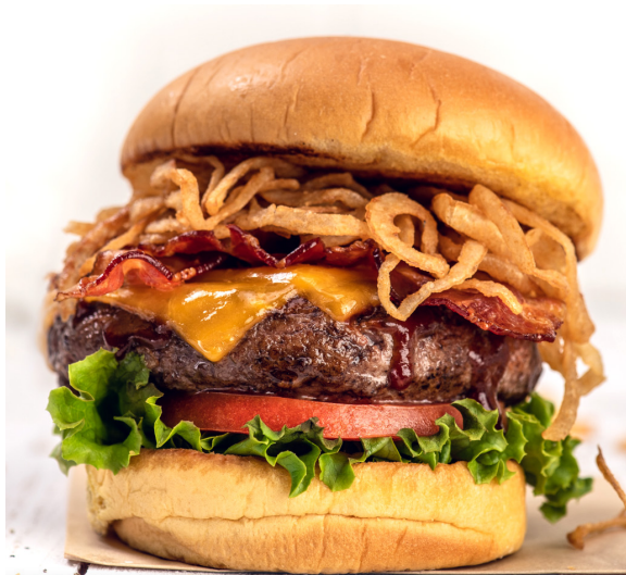
BBQ BACON CHEESEBURGER

Two smashed & stacked burgers seasoned and seared to medium-well, with pepper jack cheese, chipotle onions, leaf lettuce, vine-ripened tomato and spicy mayonnaise.* $19.99 (1282 cal)