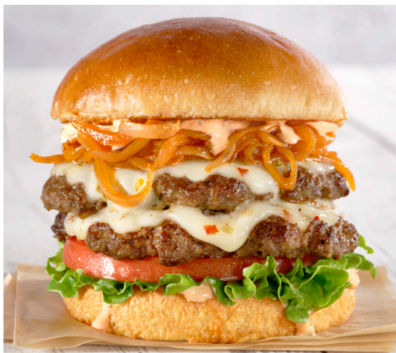
SPICY DIABLO BURGER