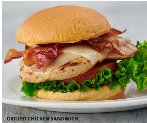
GRILLED CHICKEN SANDWICH