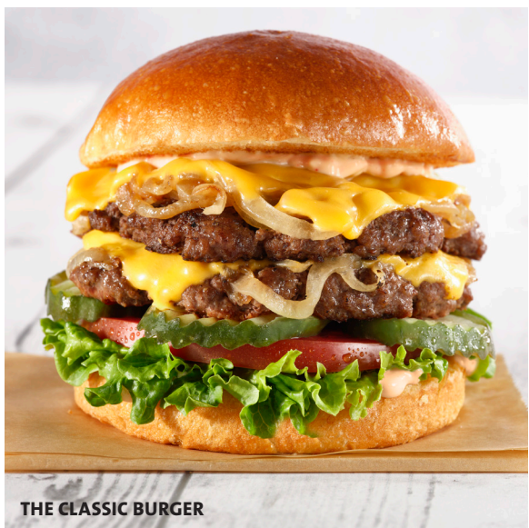
THE CLASSIC BURGER