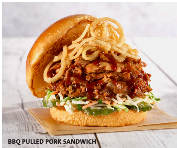
BBQ PULLED PORK SANDWICH

Grilled fresh chicken with melted Monterey Jack cheese, applewood bacon, leaf lettuce and vine-ripened tomato, served on a fresh toasted bun with honey mustard sauce. $18.99 (1149 cal)