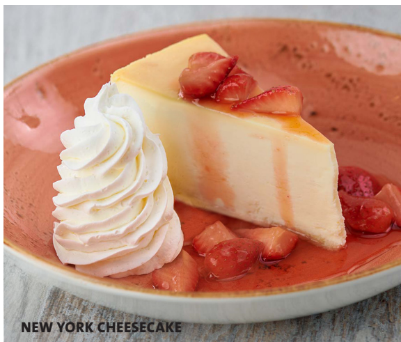
NEW YORK CHEESECAKE