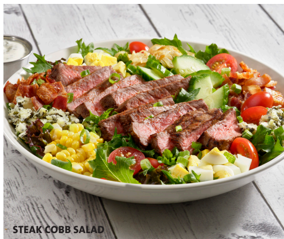
STEAK COBB SALAD