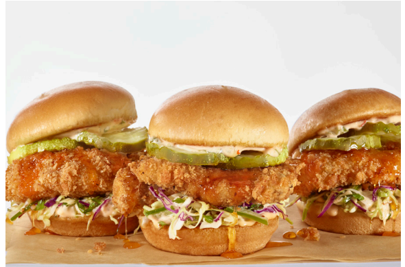
FRIED CHICKEN SLIDERS

Crispy tortilla chips layered with black beans and queso, topped with fresh pico de gallo, spicy jalapeños, melted cheddar and Monterey Jack cheese, pickled red onions, scallions and topped with lime crema. $18.99 (1550 cal) Add Guacamole $4.50 (123 cal) or Grilled Chicken $6.00 (120 cal) or Grilled Steak* $8.00 (165 cal)