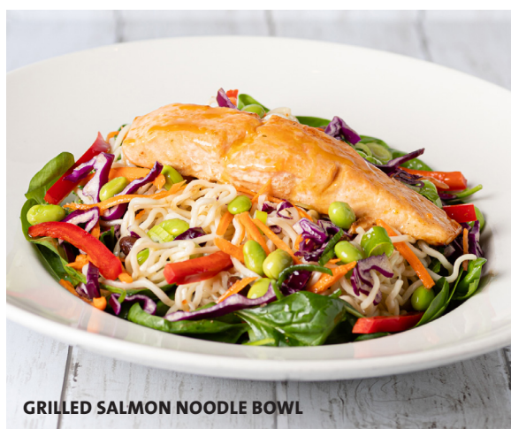
GRILLED SALMON NOODLE BOWL