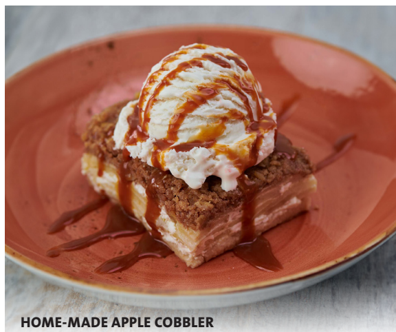
HOME-MADE APPLE COBBLER

Your choice of vanilla bean or rich chocolate ice cream blended thick and finished with fresh whipped cream. $7.50 (557 cal)