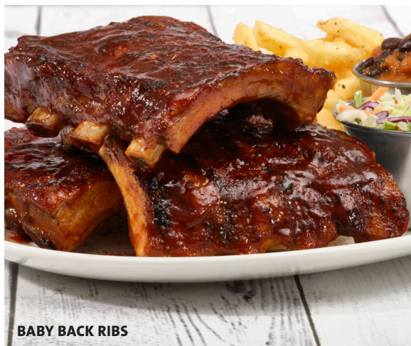
BABY BACK RIBS

Seasoned with our signature spice blend, then glazed with our house-made barbecue sauce and grilled to perfection, served with seasoned fries, coleslaw and smokehouse beans. $34.99 (2272 cal)