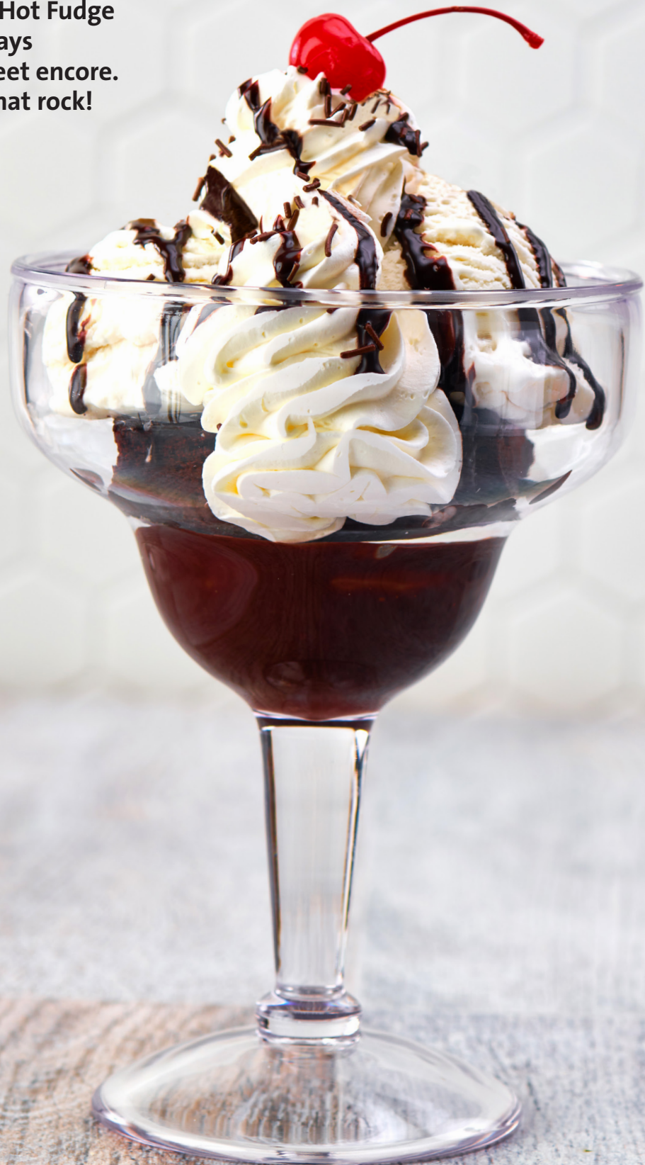
HOT FUDGE BROWNIE

From Milkshakes to Hot Fudge Brownies, nothing says rock n' roll like a sweet encore. Cheers to desserts that rock!