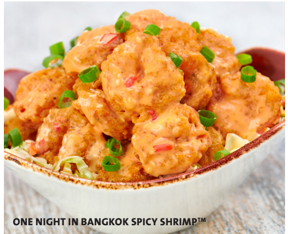
ONE NIGHT IN BANGKOK SPICY SHRIMP™

Golden tater tots layered with pulled pork, cilantro, pickled onions, lime crema and beer cheese sauce. $16.99 (1400 cal)