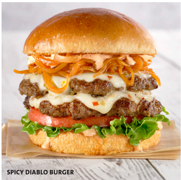
SPICY DIABLO BURGER