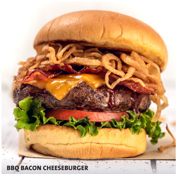
BBQ BACON CHEESEBURGER

Two smashed & stacked burgers seasoned and seared to medium-well, with pepper jack cheese, chipotle onions, leaf lettuce, vine-ripened tomato and spicy mayonnaise.* $18.99 (1282 cal)