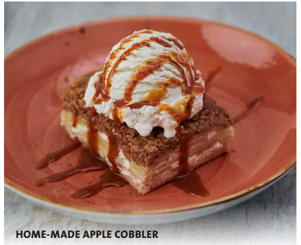
HOME-MADE APPLE COBBLER

Warm chocolate brownie topped with vanilla bean ice cream, hot fudge, chocolate sprinkles, fresh whipped cream and a cherry. $11.99 (1122 cal)