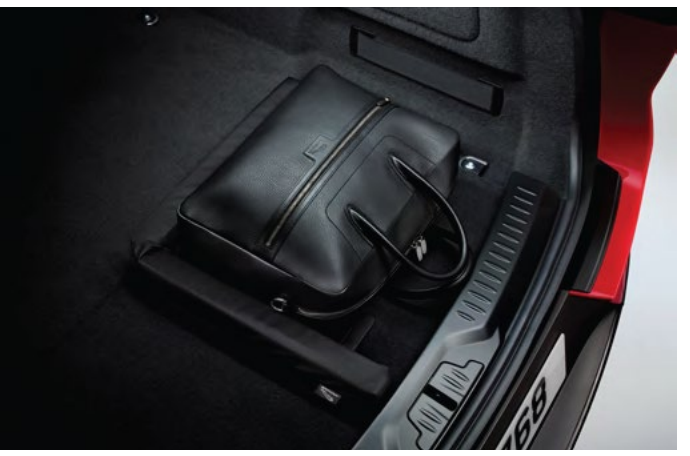
Flexible Luggage Retainer

Protects back of front seats, floor and second row seats from mud, dirt and wear and tear. Machine washable.