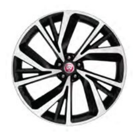
22" Style 5056, 5 split-spoke, Dark Grey Diamond Turned finish