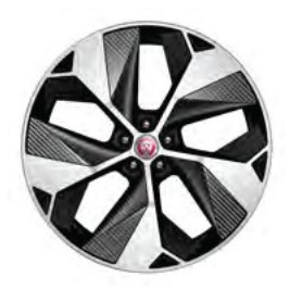
22" Style 5069, 5 spoke, Technical Grey with Carbon Fibre inserts