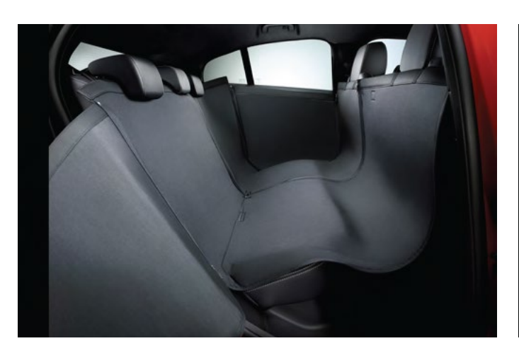
Protective Second Row Seat Cover

Protects back of front seats, floor and second row seats from mud, dirt and wear and tear. Machine washable.