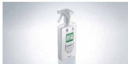
Wheel Cleaner - 500ml Trigger Spray Jaguar and Autoglym have collaborated to develop and rigorously test a unique high performance wheel cleaner.