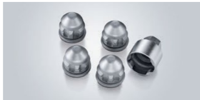
Locking Wheel Nuts - Chrome Protect wheels with custom designed high-security Chrome locking wheel nuts.