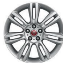
18" Matrix, 7 twin-spoke, with Silver finish