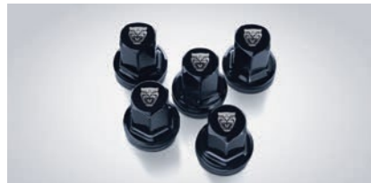
'Growler' Wheel Nuts Enhance the look of your vehicle's wheels with Jaguar branded Black wheel nuts.