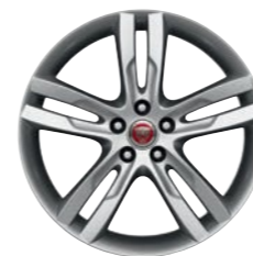
19" Star, 5 twin-spoke, with Silver finish