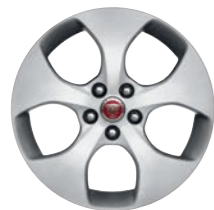
17" Projector, 5 spoke, with Silver finish

Personalise your vehicle with a selection of alloy wheels featuring a wide range of contemporary and dynamic designs.