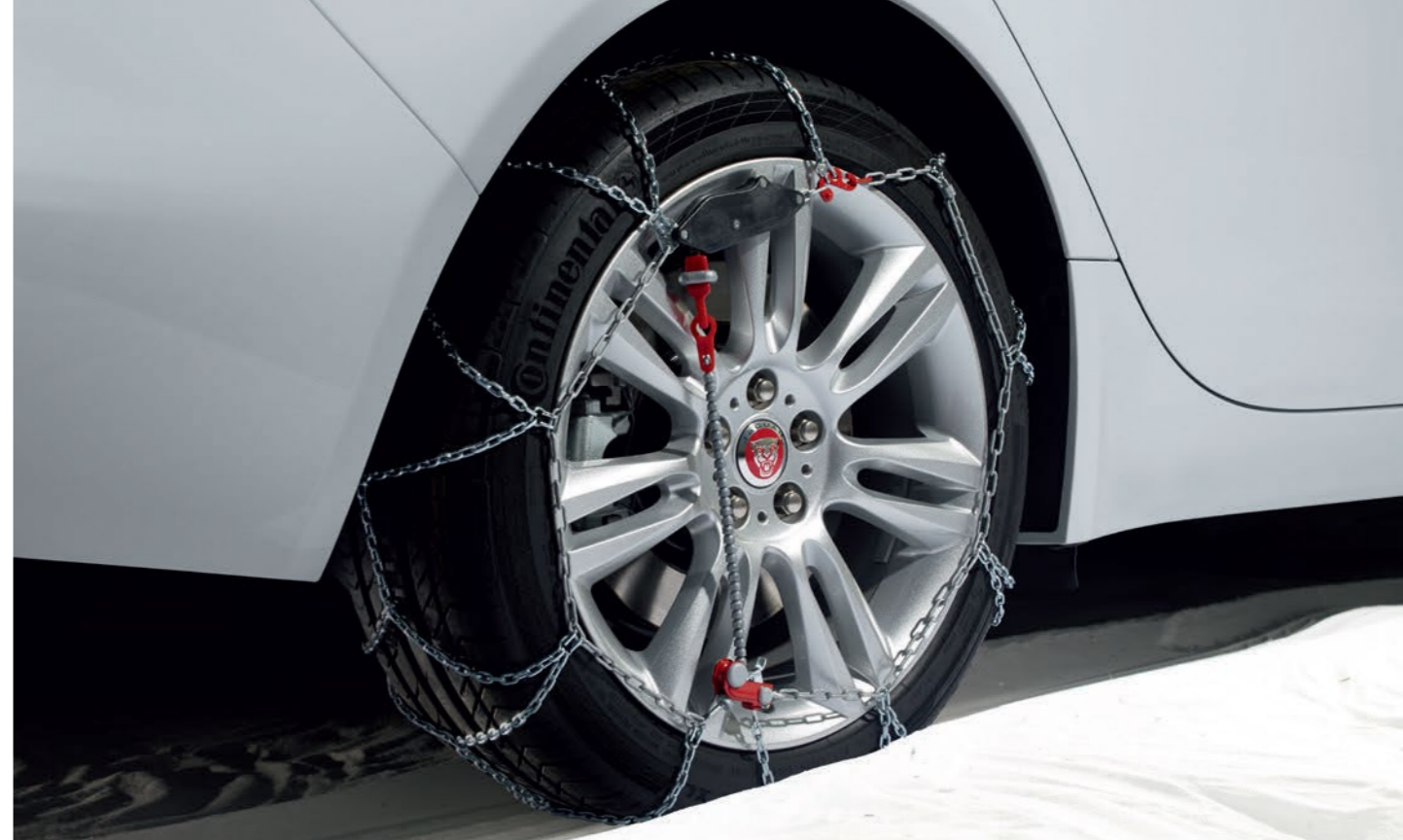
Snow Traction System Improved mobility in snow, mud and icy driving conditions with this high-grip snow chain traction system. Fits the rear wheels only.