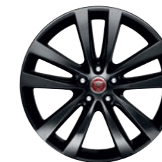
19" Venom 5 twin-spoke, with Gloss Black finish