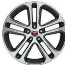
18" Templar 5 twin-spoke, with Mid Silver finish