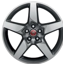
18" Star, 5 spoke, with Silver finish