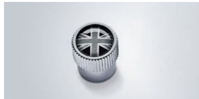
Styled Valve Caps Add the finishing touch to your vehicle's wheels with a range of unique custom valve caps.