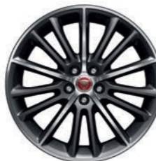
19" Radiance 15 spoke, with Black finish