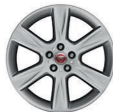
18" Arm, 6 spoke, with Silver finish