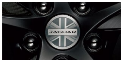
Wheel Centre Badge A distinctive monochrome centre badge featuring the Jaguar logo with a Union Jack design providing a British twist.