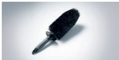
Wheel Cleaner Brush This shaped wheel cleaner brush is specifically designed to the contours of your vehicle's wheels.