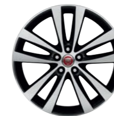
19" Venom 5 twin-spoke, Anthracite with Silver finish