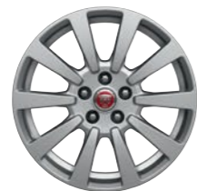
17" Turbine, 10 spoke