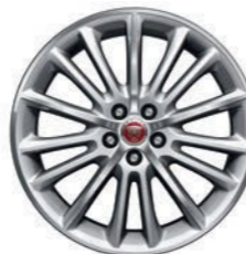
19" Radiance 15 spoke, with Silver finish