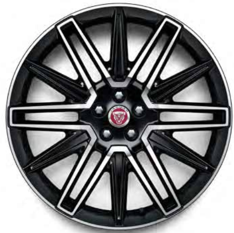
21" Style 1078, 12 split-spoke, Gloss Black Diamond Turned finish