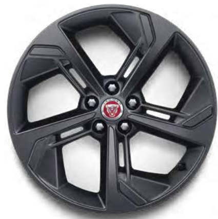
19" Style 5119, 5 spoke, Satin Dark Grey