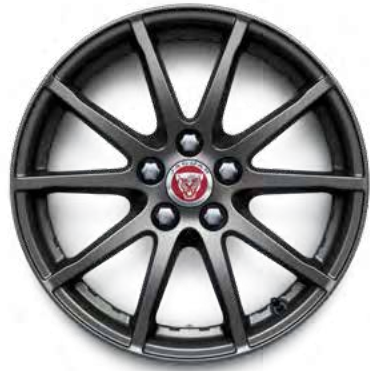
17" Style 1005, 10 spoke, Satin Dark Grey

Personalise your vehicle with a selection of alloy wheels featuring a wide range of contemporary and dynamic designs.