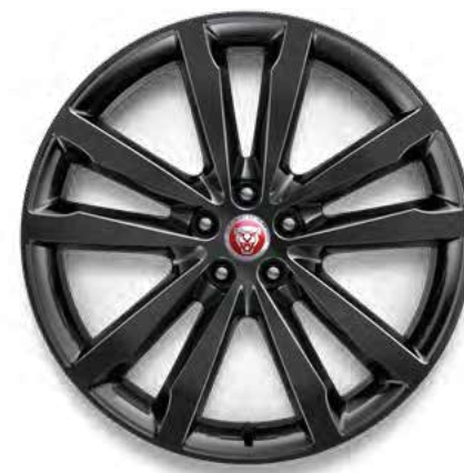
20" Style 5051, 5 split-spoke, Gloss Black