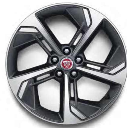
19" Style 5119, 5 spoke, Satin Dark Grey Diamond Turned finish