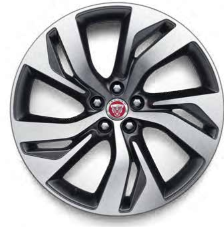
20" Style 5120, 5 spoke, Satin Grey Diamond Turned finish