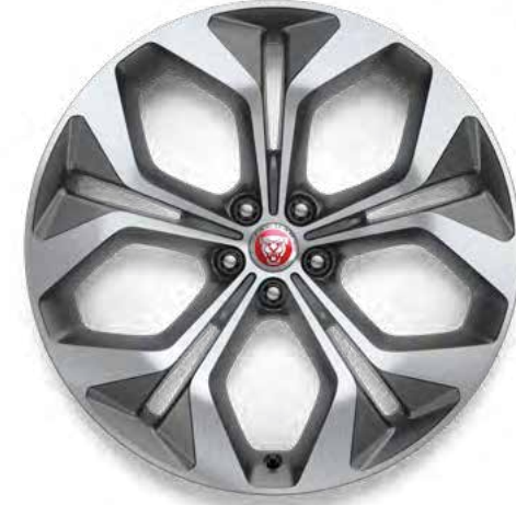
21" Style 5053, 5 split-spoke, Satin Grey Diamond Turned finish