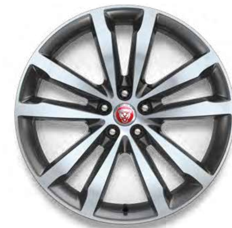
20" Style 5051, 5 split-spoke, Satin Grey Diamond Turned finish