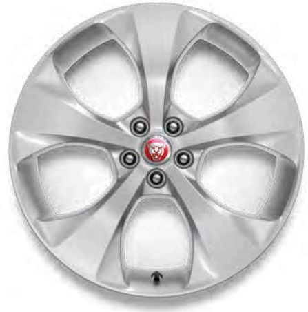
20" Style 5054, 5 spoke, Gloss Sparkle Silver

Personalise your vehicle with a selection of alloy wheels featuring a wide range of contemporary and dynamic designs.