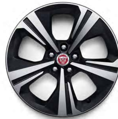
18" Style 5118, 5 spoke, Satin Black Diamond Turned finish