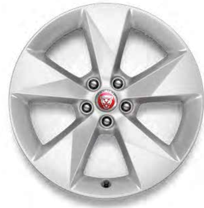
18" Style 5048, 5 spoke, Gloss Sparkle Silver