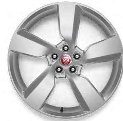
19" Style 5049, 5 spoke, Gloss Sparkle Silver