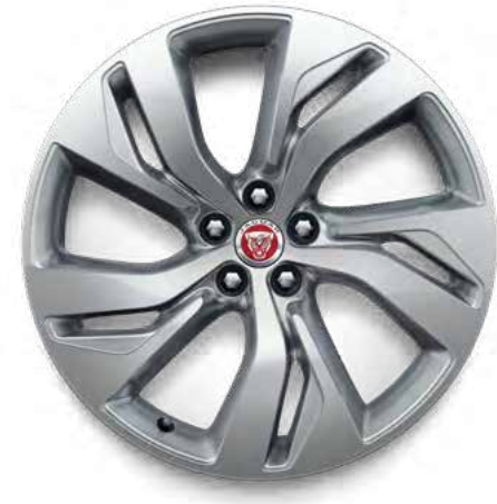
20" Style 5120, 5 spoke, Chrome Shadow