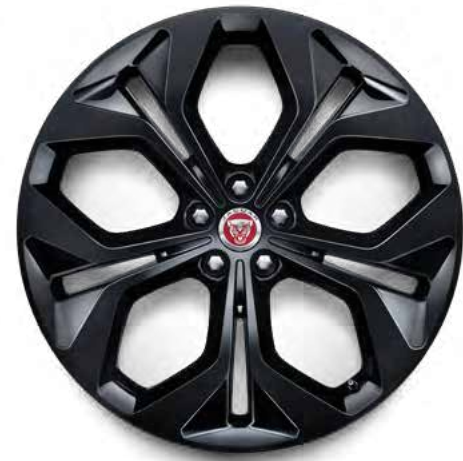
21" Style 5053, 5 split-spoke, Gloss Black