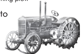
Massey Harris 25 Tractor 1931 - 1938

Change from machinery being pulled by horses and mules to using tractors, combines, and other specialized equipment