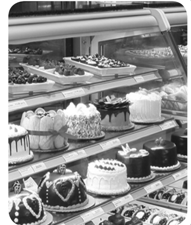
Shelves With Bakery Goods For Sale

selling the food and finished products to you