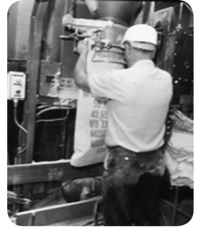
Filling Bags Of Flour At Flour Mill

changing food or fiber raw products into things we can use