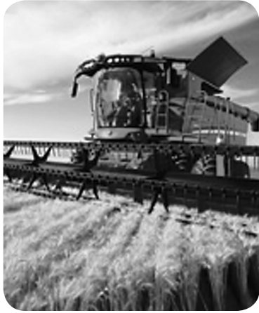
Harvesting wheat From Fields

growing and harvesting food, fiber, forests and flowers