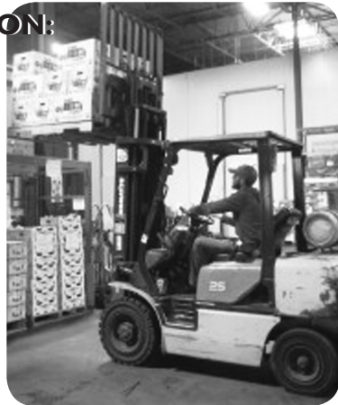
Loading Pallets For Shipping

Moving crops and food products around the state and world