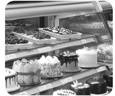
Shelves With Bakery Goods For Sale

selling the food and finished products to you