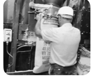
Filling Bags Of Flour At Flour Mill

changing food or fiber raw products into things we can use