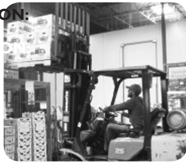
Loading Pallets For Shipping

Moving crops and food products around the state and world