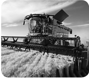
Harvesting wheat From Fields

growing and harvesting food, fiber, forests and flowers