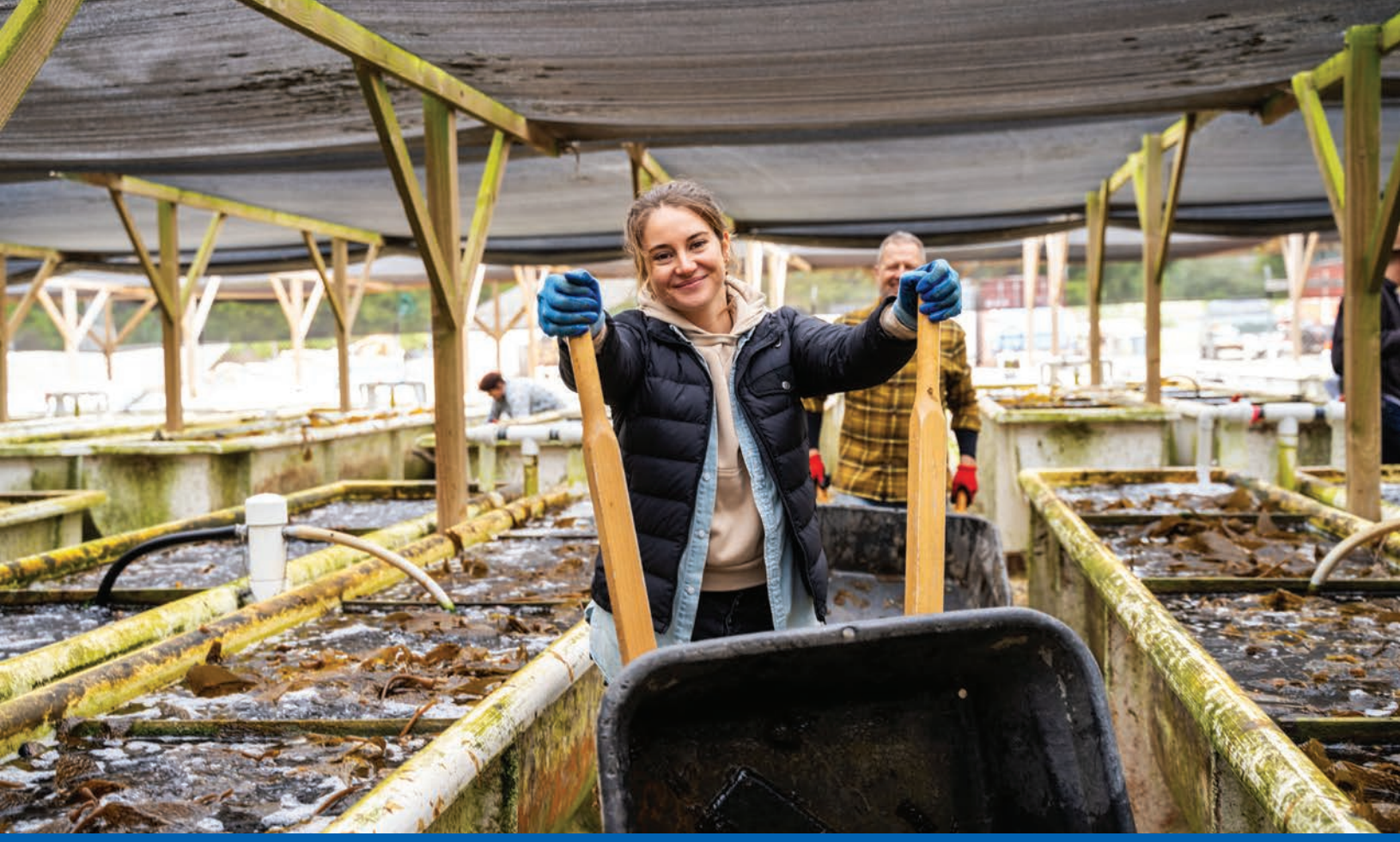
Hope in the Water - New 3-Part Series Premieres Wednesday June 19th at 9 p.m. on KPBS