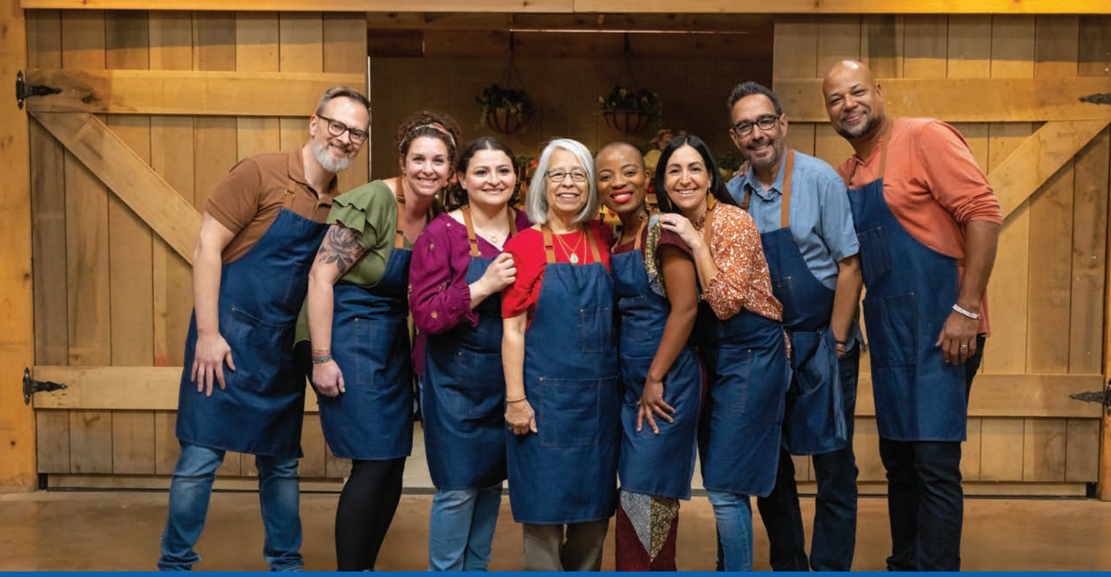
Great American Recipe - New Season Debuts Monday June 17th at 9 p.m. on KPBS