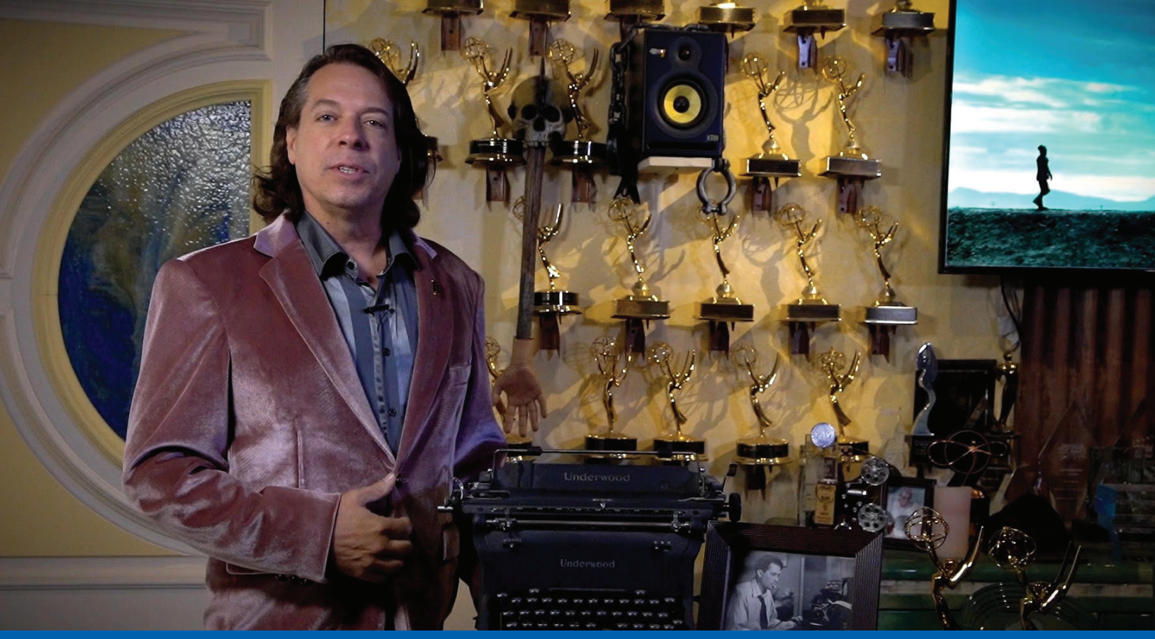
San Diego Film Awards 2024 - Premieres Saturday June 22nd at 8 p.m. on KPBS