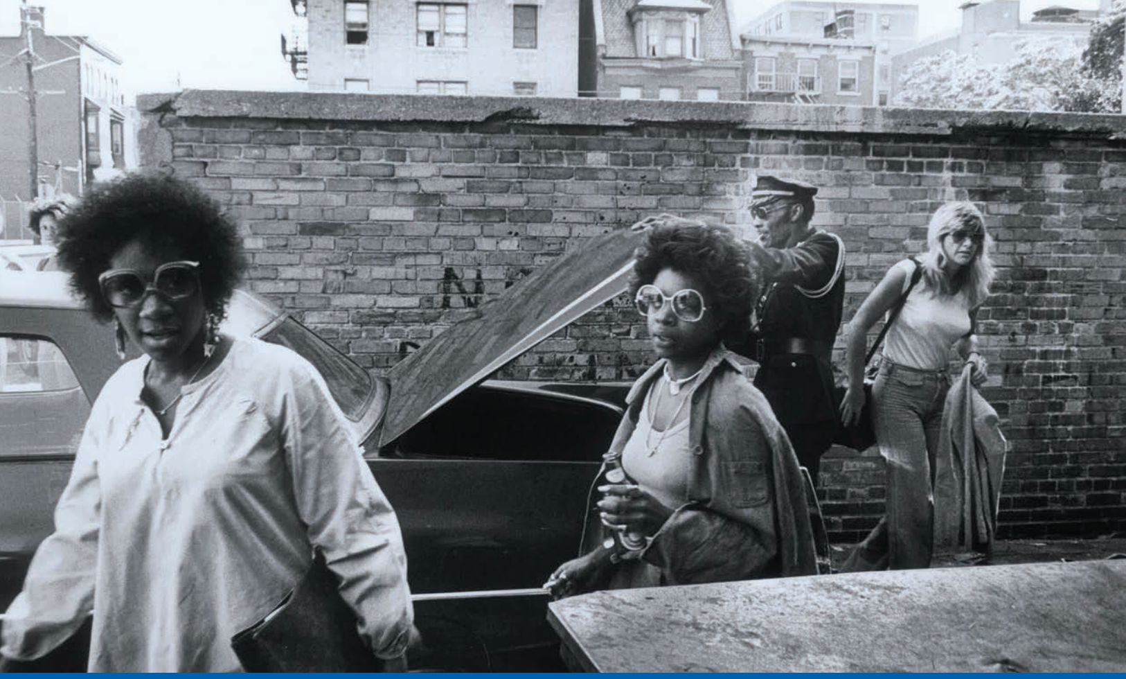
Disco: Soundtrack of a Revolution - New 3-Part Series Premieres Tuesday June 18th at 9 p.m. on KPBS