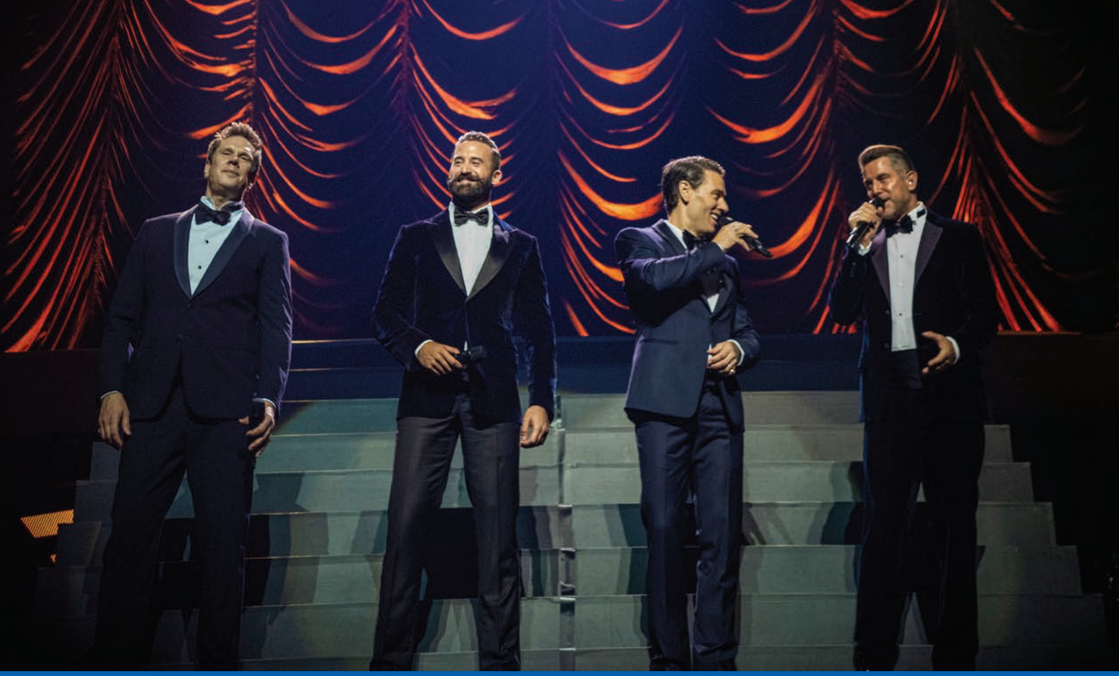
I Divo XX, Live From Taipei - Premieres Saturday June 1st at 7 p.m. on KPBS2; Encore at 9 p.m. on KPBS