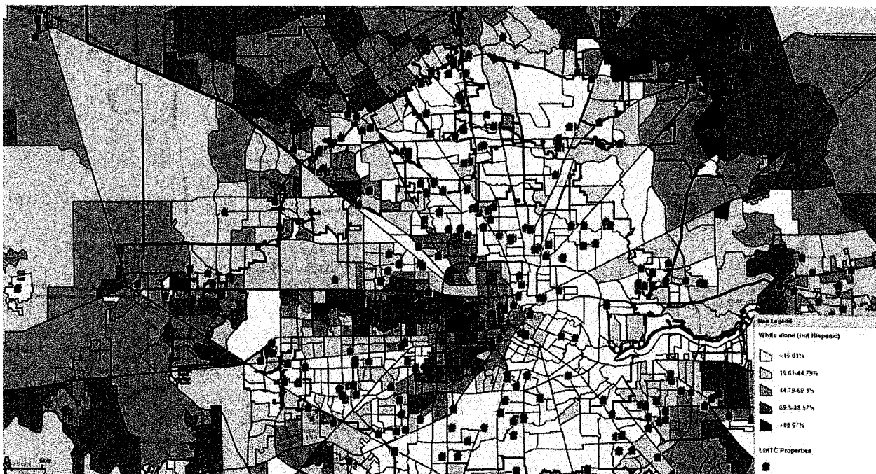
Map of LIHTC Properties in Houston

Based on information provided by the City, during the period of 2012 to April 13, 2016, of 23 4% multifamily projects recommended by HCDD for a Resolution from the Council, 21 (91%) were majority minority census tracts, and neither of the remaining two are family housing. One, the Light Rail Lofts, is housing for homeless veterans and the other, the Retreat at Westlock, is a senior property. Retreat at Westlock was originally proposed as family housing but after encountering significant local opposition, was resubmitted as restricted housing for residents 62