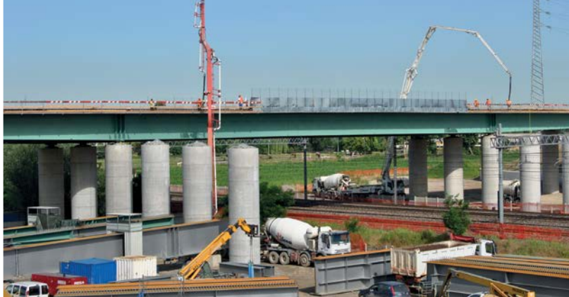
Edge beam Slab on viaduct