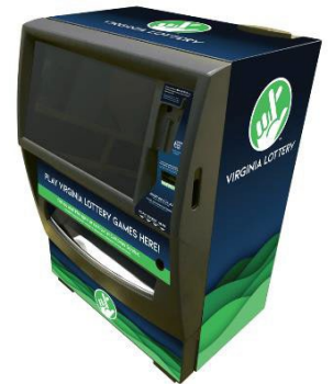
Lottery Vending Machine (20)