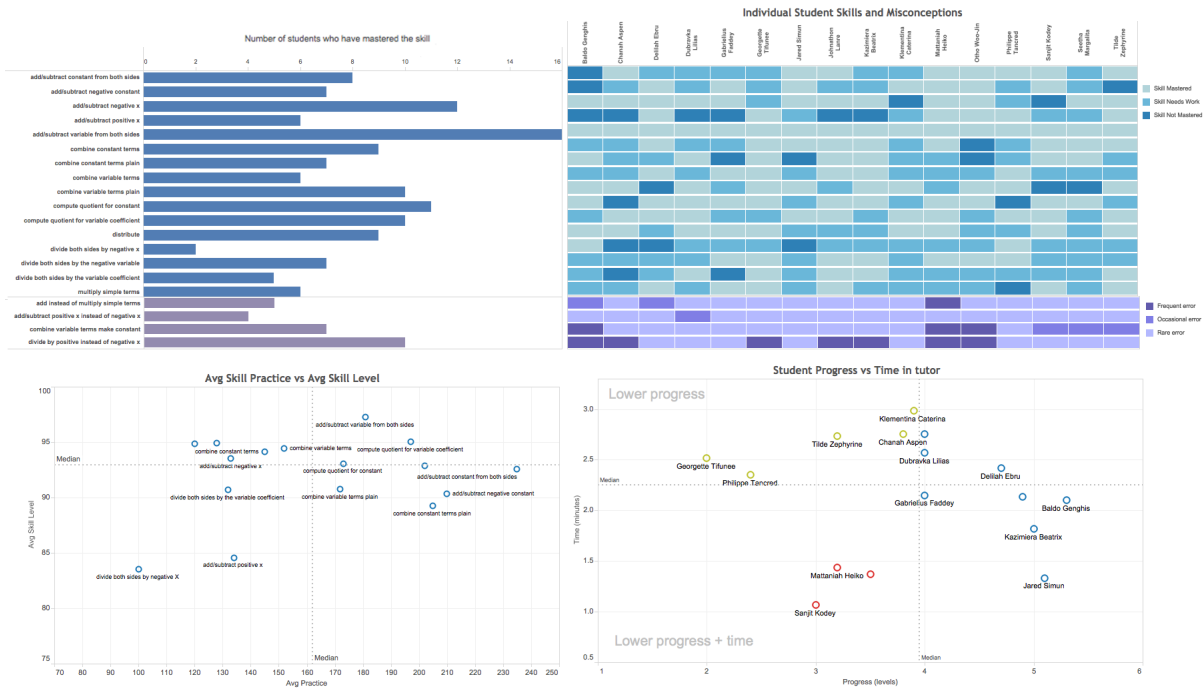
Figure 3. A medium-fidelity prototype created using Contextual Inquiry and Speed Dating data. It displays information (from top to bottom, left to right) on the number of students who have mastered each skill or have misconceptions, skill mastery and misconceptions per student, average skill mastery plotted against average amount of practice and student time in tutor plotted against student progress.

analytics they generate themselves. These analytics influence their decisions both at the class level and the individual level. We also found that teachers paid a great amount of attention to student errors, perhaps because (in a domain such as algebra) errors tend to be very actionable (e.g., the teacher might discuss the given error in class). The methods, data, and findings are described in more detail in [50].