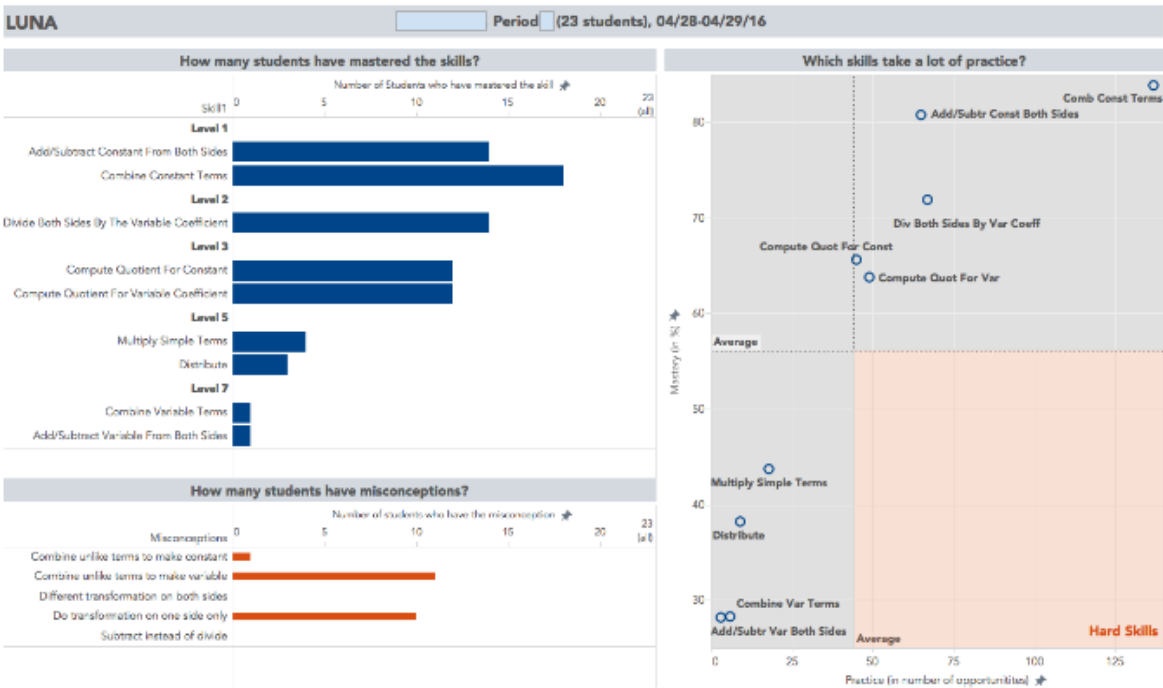
Figure 4. One of the two screens of high-fidelity prototype of the dashboard that was used in a classroom study with real student data from the teacher’s current classes. This screen displays information about the performance of the class as a whole, in the form of number of students who have mastered each skill (top-left), average skill mastery plotted against average amount of practice (right), and prevalence of particular misconceptions (bottom-left).

the “raw data” upon which these summaries were based, or to better understand how these summaries were generated. We are currently in the process of analyzing data from these prototyping sessions, to inform future design iterations. We are also conducting additional Speed Dating sessions to inform the design of a dashboard used in the on-the-spot scenario. In our current Speed Dating sessions, we are exploring the potential usefulness of a broader range of analytics, while also exploring some of the interesting tensions and trade-offs that teachers highlighted during our previous speed dating and prototyping sessions.