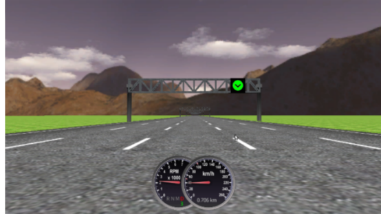
Fig. 2. Lane change signal as presented on screen; the green light above the far right lane informs the driver to move into that lane.

driving speed was 40 km/h and the maximum possible speed was 70 km/h. The driving equipment consisted of a 40-inch 16:9 screen and a Thrustmaster PC Racing Wheels Ferrari GT Experience steering wheel and pedal.