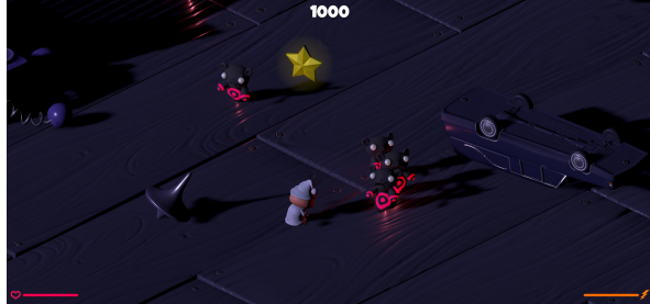
(b) Freud me out 2 gameplay