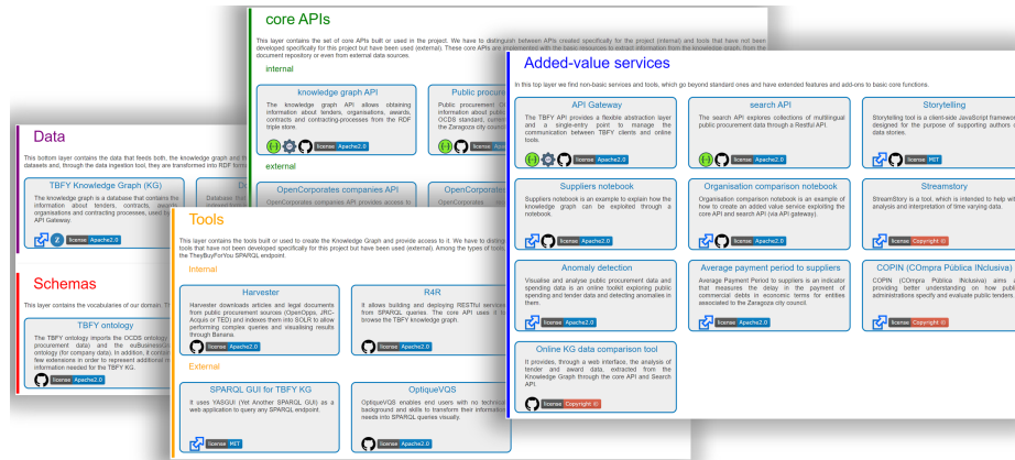
Fig. 2. The catalogue for data, schemas, core APIs, tools, and added value services.

the public procurement data (using rdfs:seeAlso ). The data is made available through a SPARQL API, a core REST-based API (i.e., KG API), a cross-lingual search API, and an API gateway providing a single entry point to the previously mentioned APIs. The current release of the KG covers data from January 2019 onwards. New data is onboarded on a daily basis. As of August 2020, the KG consists of more than 126 million triples and contains information about 1,31 million tenders, 1,54 million awards, and more than 99 thousand companies 5 . The source data collected from the data providers in JSON and the KG data in RDF are made openly available under the Open Database License (ODbl) 6 on Zenodo 7 . An online catalogue is available 8 providing access to data, schemas, core APIs, tools, and added value services (see Fig. 2).