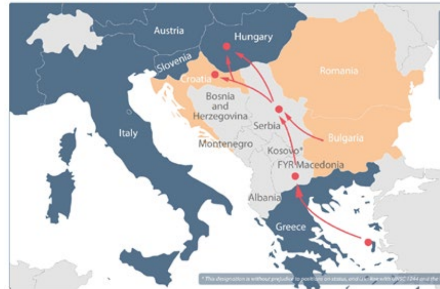
Figure 1 – The Western Balkan route