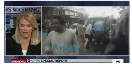
24/7 coverage of breaking news and live events