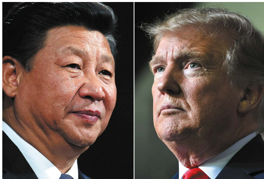
Tensions between Presidents Xi Jinping and Donald Trump are spilling into research.