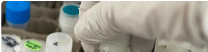
EU signs initial deal with Novavax for COVID-19 vaccine