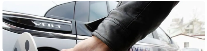
Russia plans to subsidise electric cars to spur demand