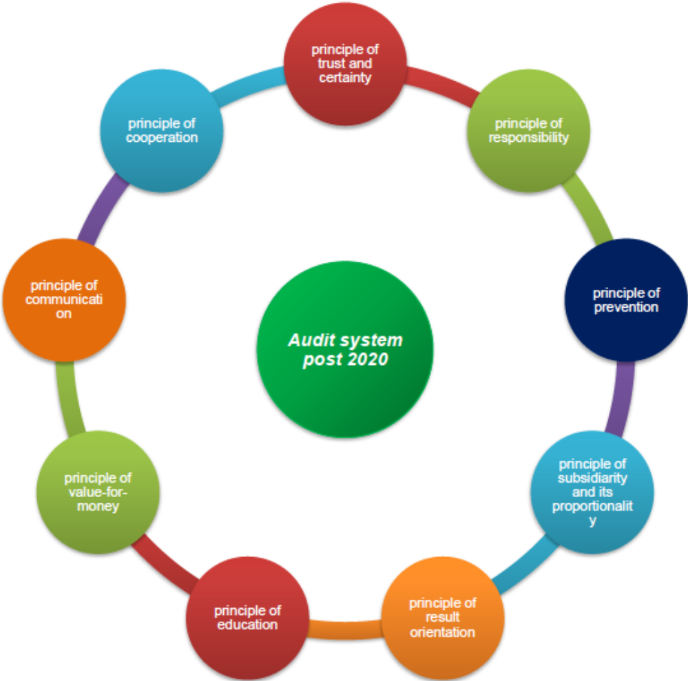
Figure 3. Nine principles of the audit system post-2020

The proposal of the High-Level Group recommends a single auditing process through multiple reforms, strengthening the nine principles of audits, as presented in Figure 3.