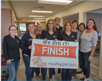
West Community CU CORE Triathlon