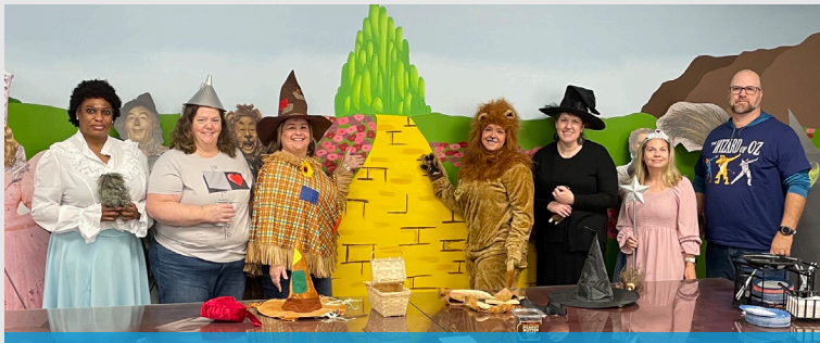
Members Heritage CU Follows the Yellow Brick Road to KeyStone