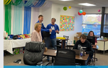
Members Heritage CU