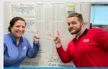
West Community CU