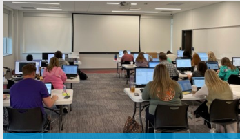
Working Hard at Carter FCU