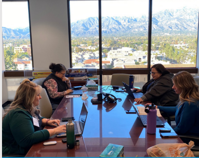
Balancing at LA Financial CU