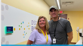
Smiles at NIHFCU