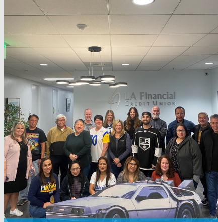
Back to the Future at LA Financial CU