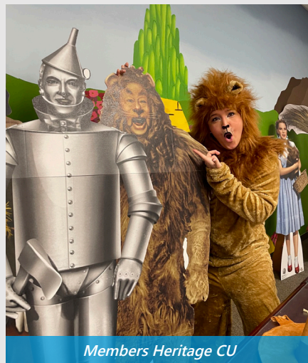
Members Heritage CU