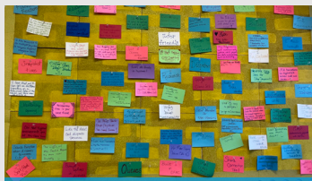
Members Heritage WOW Board