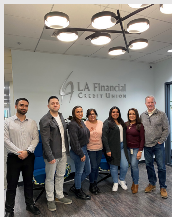
LA Financial CU Team