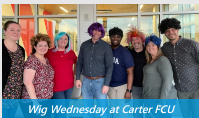
Wig Wednesday at Carter FCU