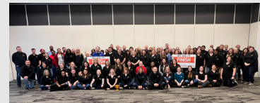
West Community CU Team