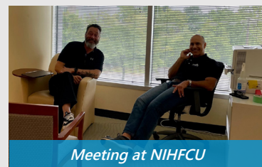
Meeting at NIHFCU