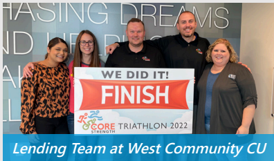
Lending Team at West Community CU