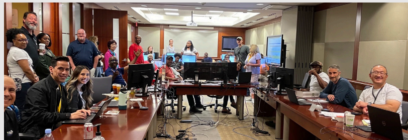
NIHFCU Ready to Kick Off their KeyStone Conversion