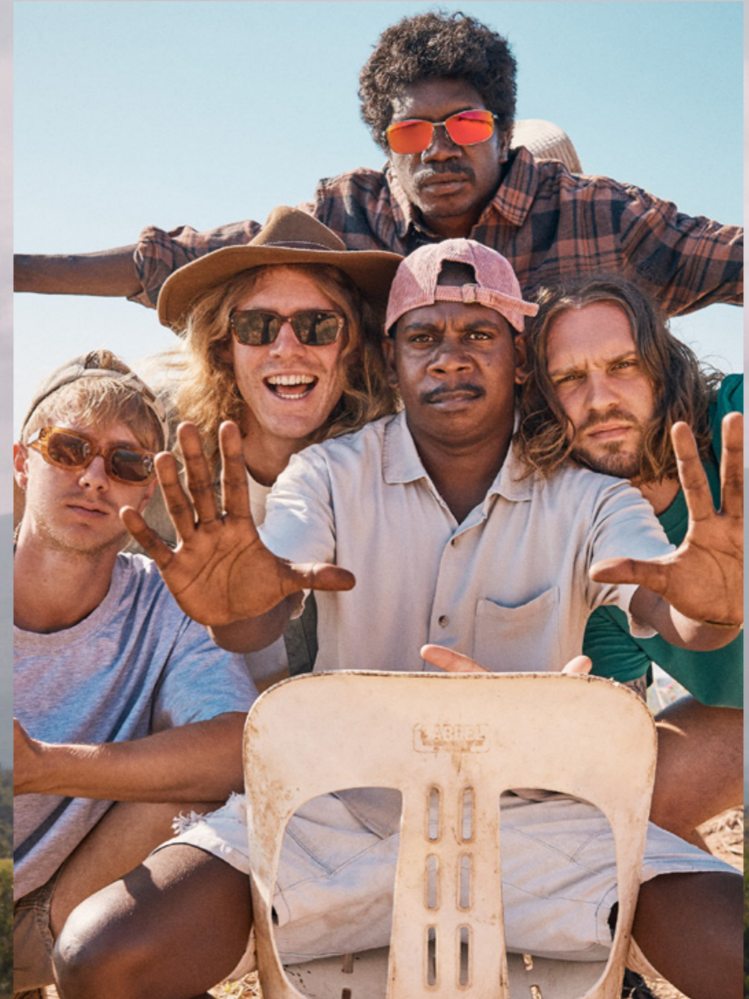
Cotton On x King Stingray partnership Yirrkala, Northern Territory