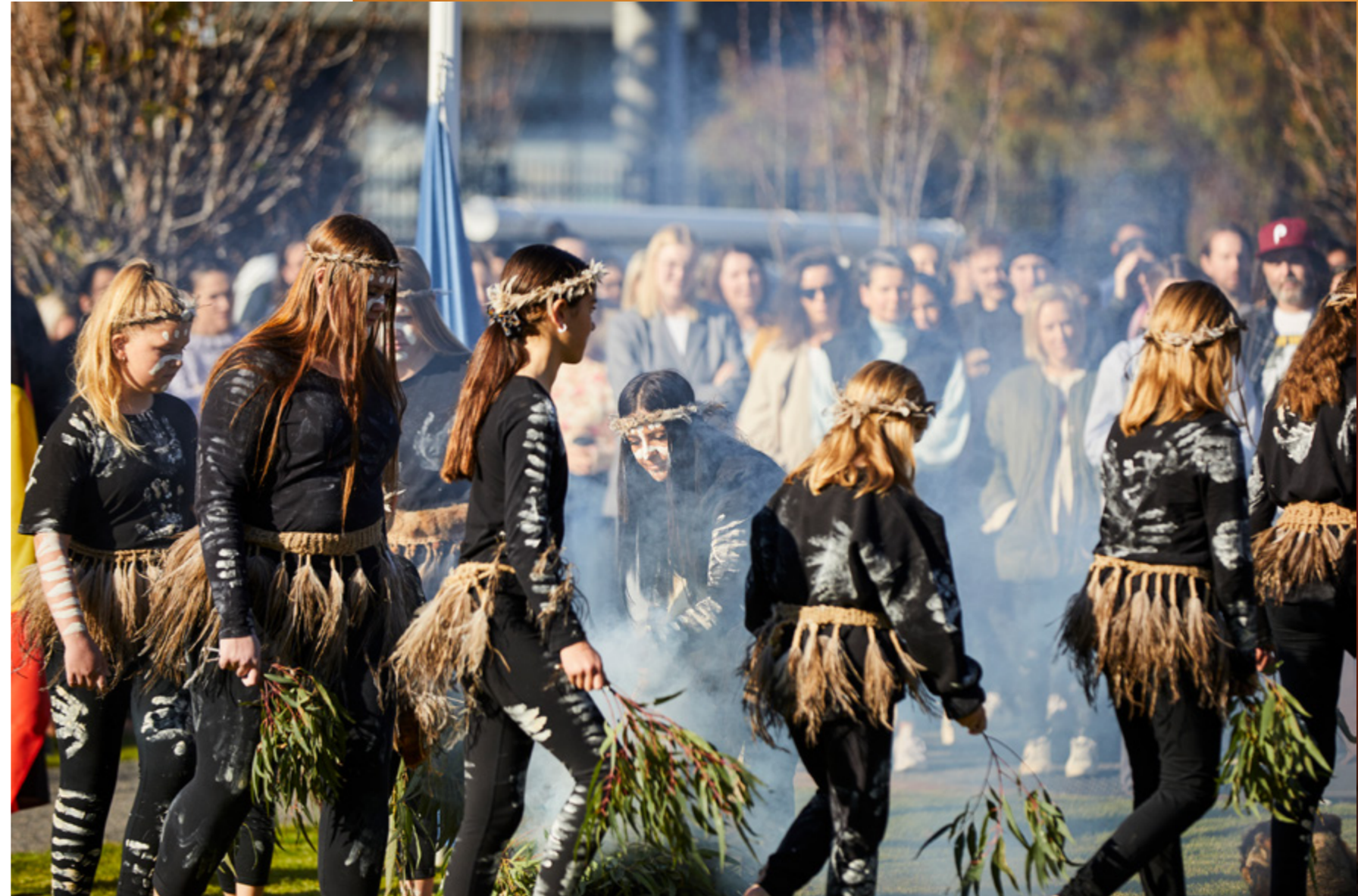
NAIDOC Week at Cotton On Global Support Centre Wadawurrung Country North Geelong, Victoria