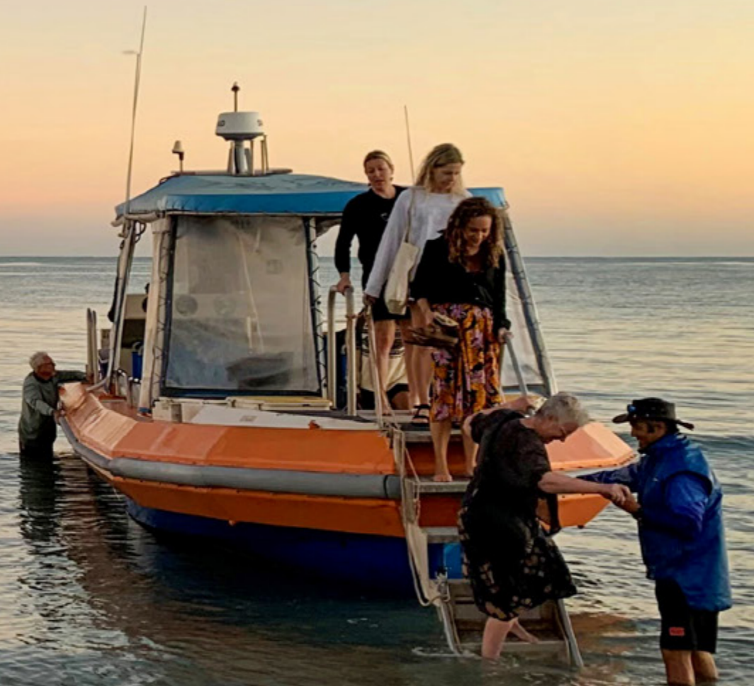
Cotton On team members arriving at Bolulawuy, Northern Territory