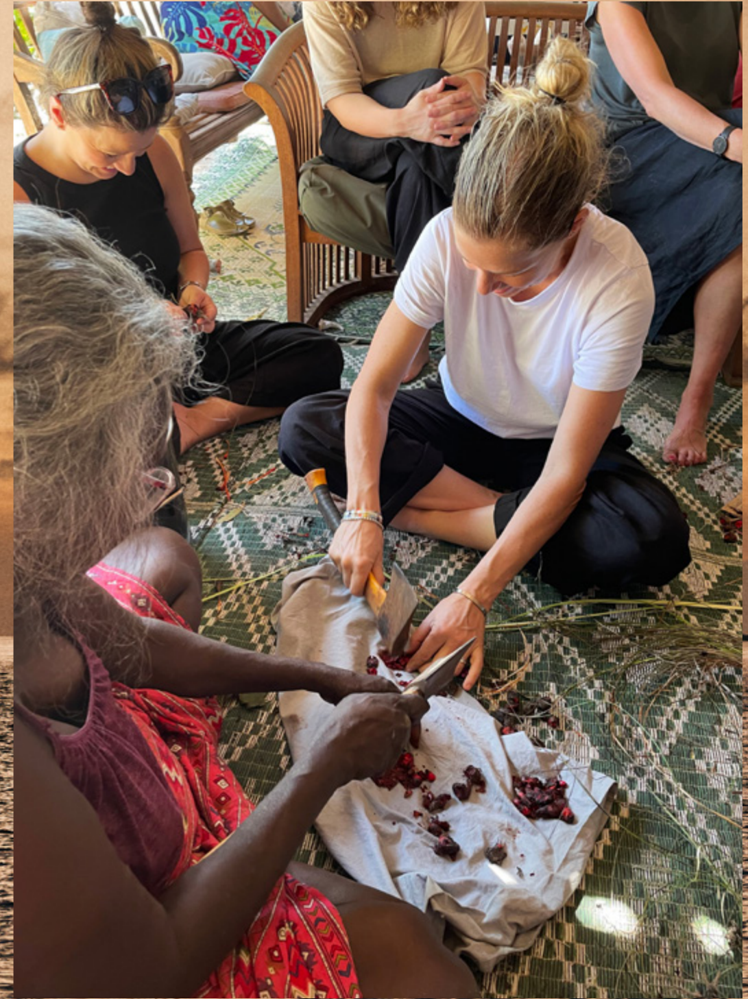
Cotton On team with community members Dhambaliya, Northern Territory