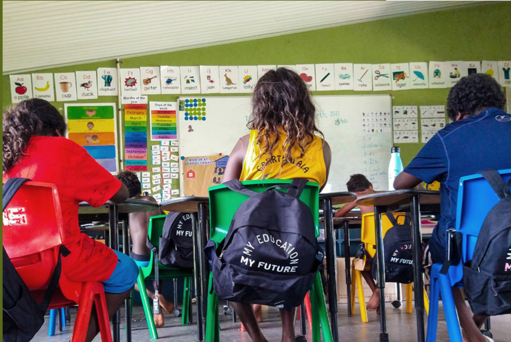
Students at Cotton On Foundation support school Garrthlala, Northern Territory

While this may be our first formal Reconciliation Action Plan, we've been working to embed reconciliation in our business for many years and we're proud of our journey so far.