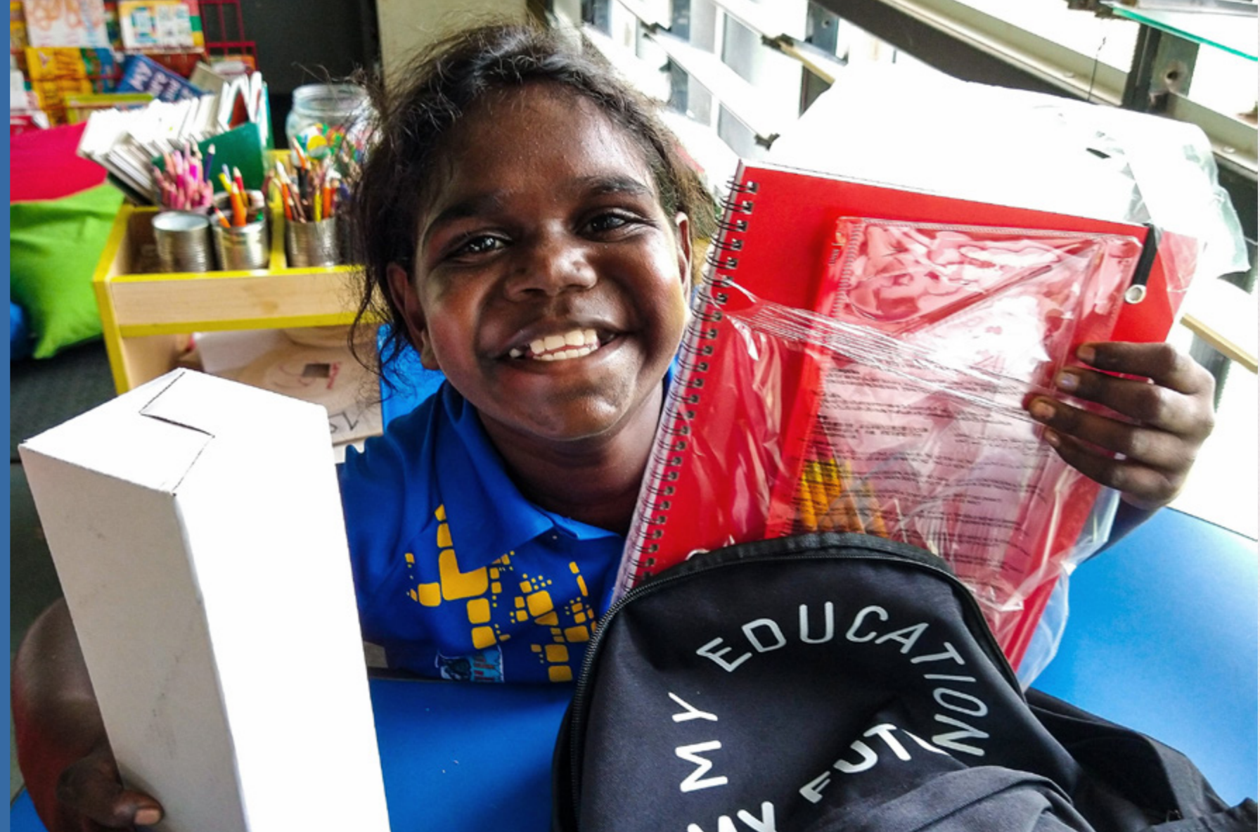
Student receiving Cotton On Foundation back-to-school pack Garrthalala, Northern Territory