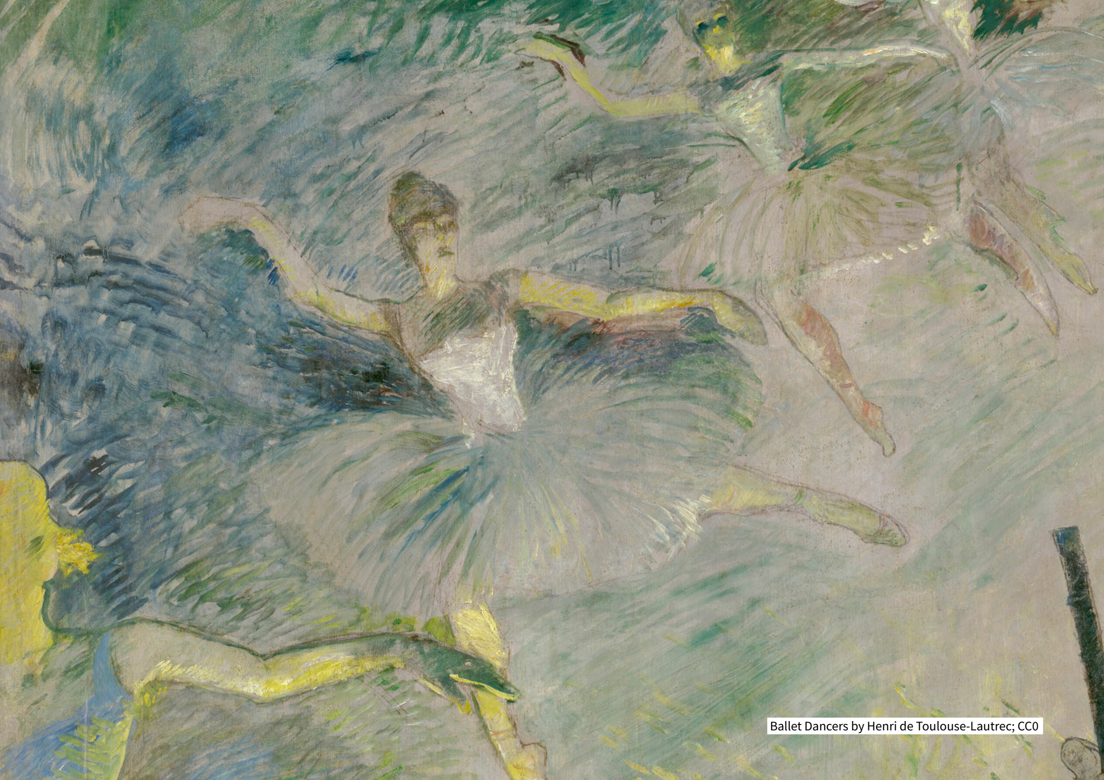
Ballet Dancers by Henri de Toulouse-Lautrec; CC0