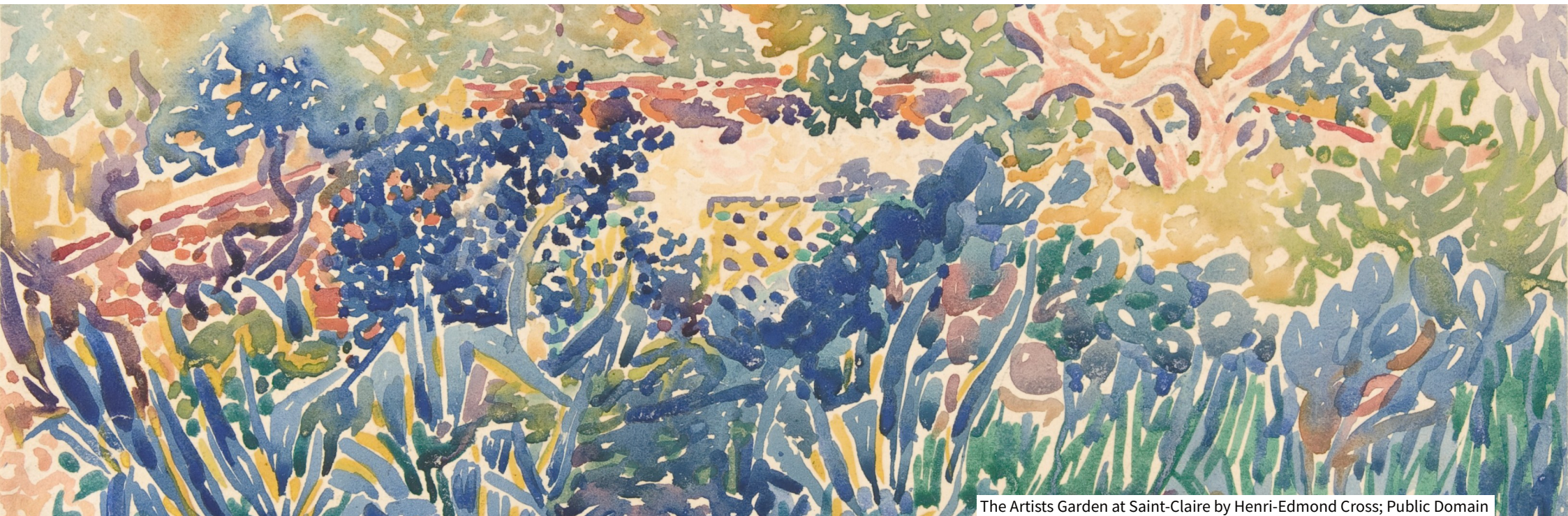
The Artists Garden at Saint-Claire by Henri-Edmond Cross; Public Domain