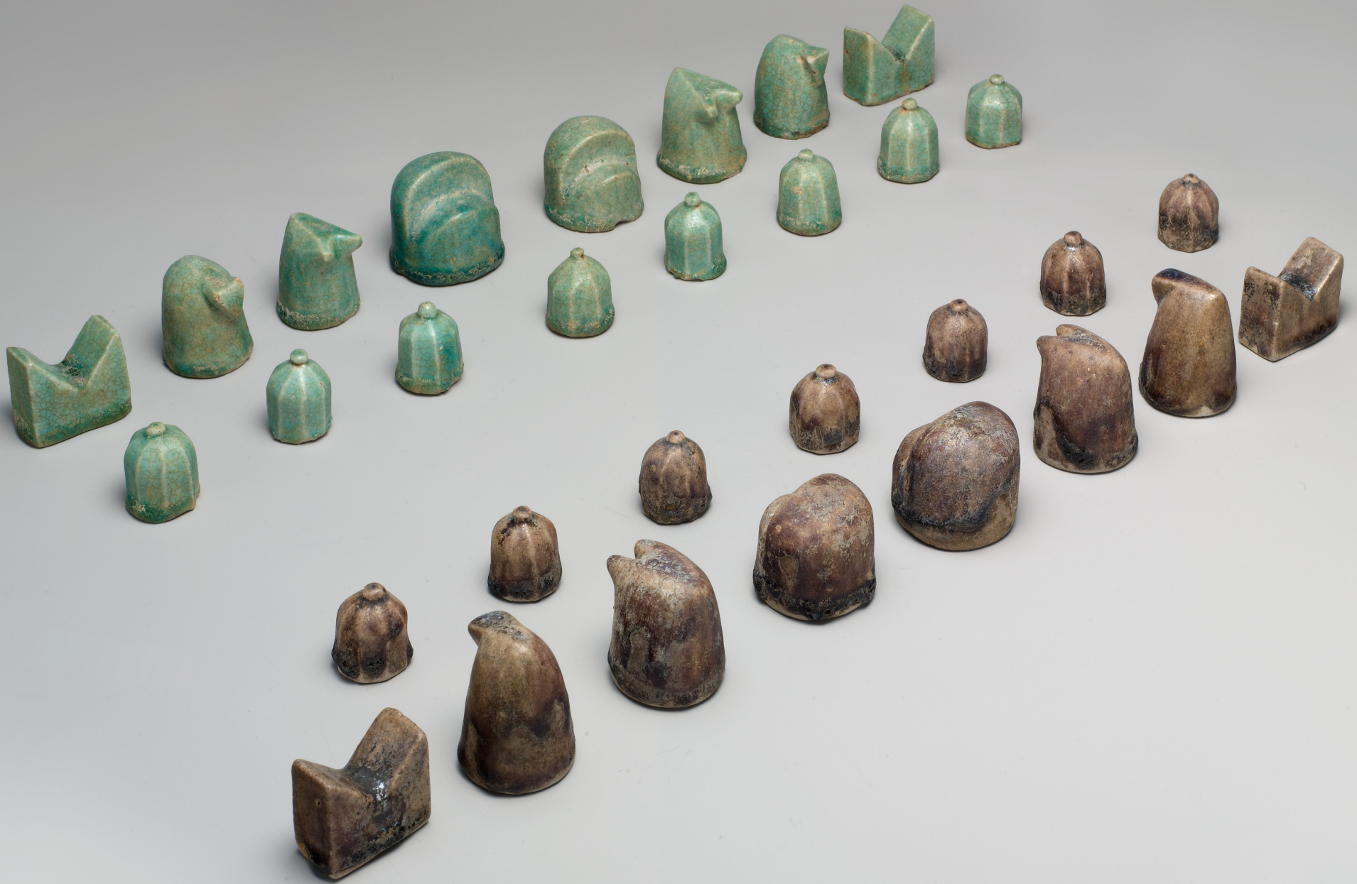
12th Century Chess Set; Public Domain