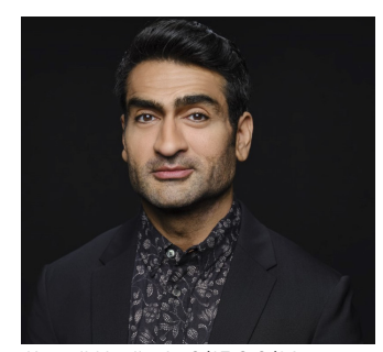
Kumail Nanjiani • 9/13 & 9/14

Arizona Center: See Thursday for more details. $69. 7:00 PM & 9:00 PM.