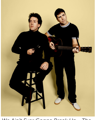
We Ain't Ever Gonna Break Up - The Hymon & Parfunkel Musical 9/11 - 9/15

THE MYSTERINES Last Exit Live: $20 - $25. 7:30 PM. 717 S Central Ave lastexitlive.com