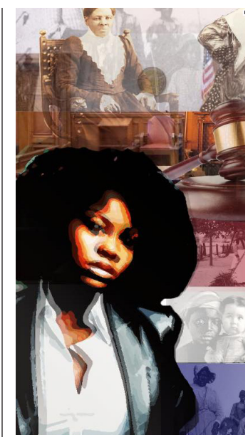
The Trial • 9/12 - 9/15