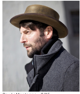
Ray LaMontagne • 9/15

EL GRITO PHOENIX: Welcome to the 'El Grito' Festival, an electrifying celebration of Mexican Independence Day. This vibrant event is returning for its second year to Downtown Phoenix, and they're thrilled to invite you to immerse yourself in the rich culture, delicious cuisine, and captivating entertainment that Mexico has to offer. Much like America's 4th of July, Mexican Independence Day is a momentous occasion commemorating the battle cry that ignited the rebellion for independence in 1810. Pay homage to this historic moment with a grand fiesta that captures the essence of freedom, unity, and joy. Indulge in an exquisite array of authentic Mexican cuisine that will transport your taste buds directly to Mexico. From savory tacos to mouthwatering tamales, the festival promises a feast for your senses. Free to attend. 4:00 - 11:00 PM. 200 W Washington St 602-262-7446 elgritophoenix.com 9/15.