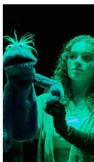
Lost Boys: Live & Undead 9/12 - 9/15

130 N Central Ave 602-368-3121 valleybarphx.com