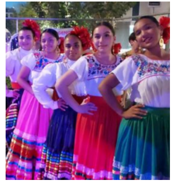
El Grito Phoenix • 9/15