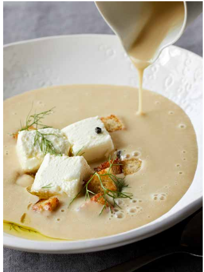
Creamy Potato Fennel Soup , Go-To Dinners 84

Brioche Croutons , Family Style 34 Matzo Balls , Parties! 63 Parmesan Croutons , Barefoot Contessa Cookbook 87 Puff Pastry Croutons , Modern Comfort Food 61 Toasted Croutons , Modern Comfort Food 70