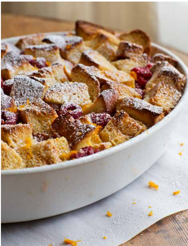
Raspberry Baked French Toast, Make It Ahead 258