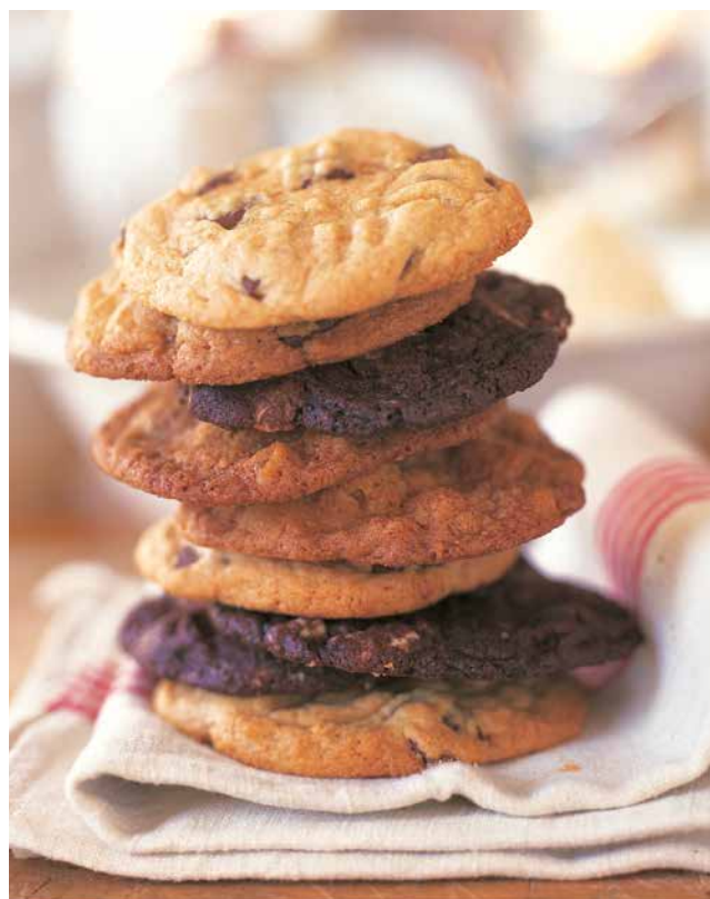
Chocolate Chunk Cookies, Parties! 235

Apple Pie Bars, Cooking for Jeffrey 214 Black & White Cookies, Modern Comfort Food 192 Cherry Pistachio Biscotti, Cooking for Jeffrey 182 Chocolate Chunk Blondies, Foolproof 233 Chocolate Chunk Cookies, Parties! 235 Chocolate-Dipped Brown Sugar Shortbread, Modern Comfort Food 218 Chocolate Hazelnut Cookies, How Easy Is That? 228 Chocolate Peanut Butter Globbs, Foolproof 230 Cinnamon-Spiced Shortbread, Go-To Dinners 243 Coconut Macaroons, Family Style 163 Coconut Madeleines, Barefoot in Paris 212 Elephant Ears, Barefoot in Paris 197 English Chocolate Crisps, Make It Ahead 232 Fruitcake Cookies, At Home 195 Giant Crinkled Chocolate Chip Cookies, Modern Comfort Food 211 Ginger Shortbread, Make It Ahead 230 Jam Thumbprint Cookies, Family Style 208 Lemon Bars, Parties! 200 Lemon Meringue Squares, Go-To Dinners 222 “Linzer Cookies,” Barefoot Contessa Cookbook 178 Orange French Lace Cookies, Foolproof 236 Outrageous Brownies, Barefoot Contessa Cookbook 172 Peanut Butter & Jelly Bars, At Home 170 Peanut Butter Chocolate Chunk Cookies, Parties! 236 Pecan Sandies, Foolproof 219