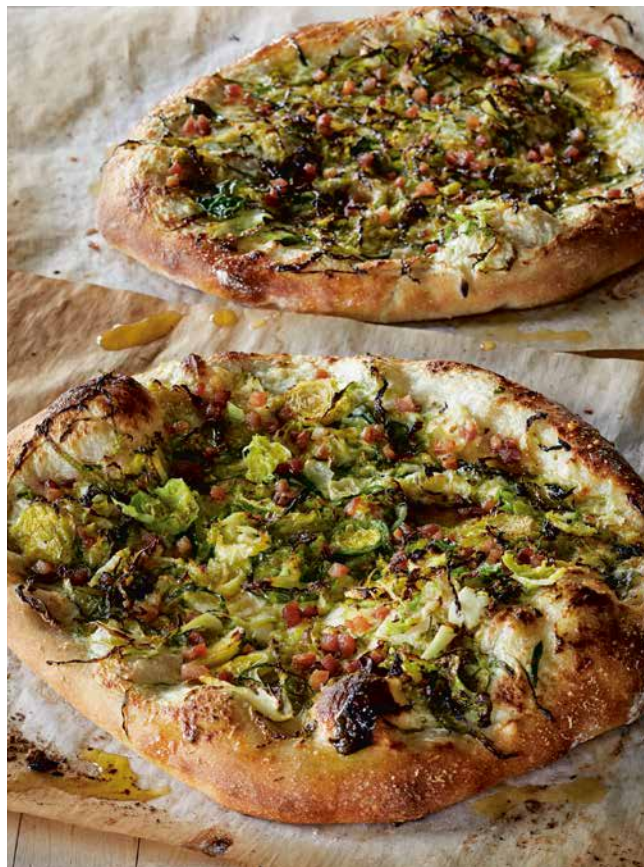
Brussels Sprouts Pizza Carbonara, Modern Comfort Food 136

Lemon Capellini with Caviar, Barefoot Contessa Cookbook 129