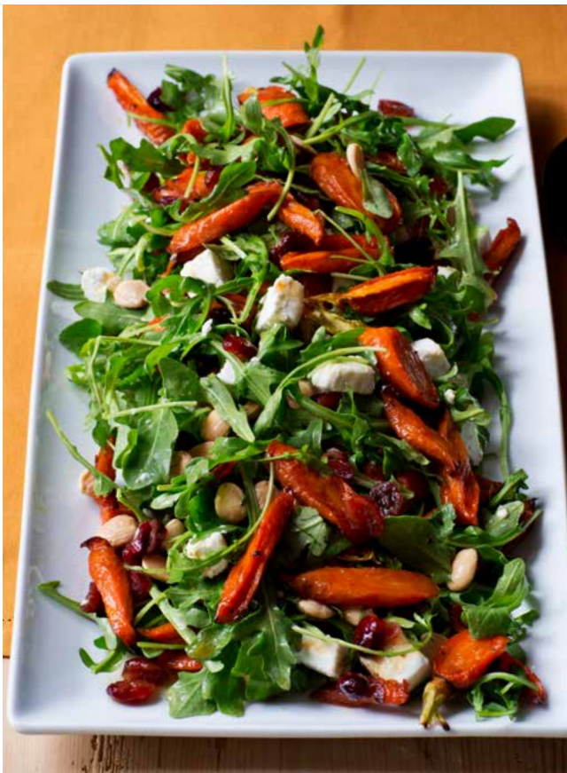
Maple-Roasted Carrot Salad, Cooking for Jeffrey 102

Roasted Beet, Butternut Squash & Apple Salad, Cook Like a Pro 58