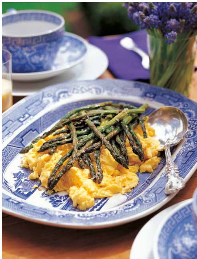
Roasted Asparagus with Scrambled Eggs, Parties! 34