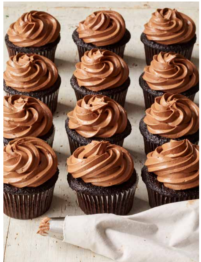
Beatty's Chocolate Cupcakes, Go-To Dinners 233