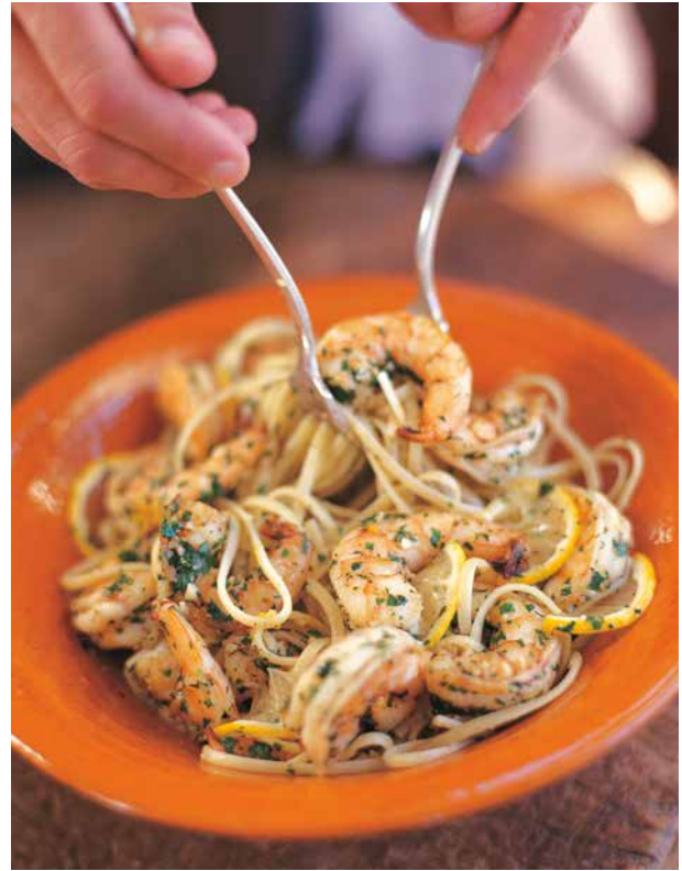
Linguine with Shrimp Scampi, Family Style 106

Amelia's Jambalaya, Foolproof 161 Asian Grilled Salmon, Parties! 124 Baked Cod with Garlic & Herb Ritz Crumbs, Modern Comfort Food 125 Baked Shrimp Scampi, Back to Basics 128 Bay Scallop Gratins, Back to Basics 132 Caesar-Roasted Swordfish, How Easy Is That? 150 Creamy Eggs with Lobster & Crab, Go-To Dinners 109 Cioppino, Cook Like a Pro 87 Easy Coquilles Saint Jacques, Make It Ahead 133 Easy Lobster Paella, At Home 124 Easy Sole Meunière, Back to Basics 131 Eli's Asian Salmon, At Home 118 Fennel & Garlic Shrimp, Foolproof 93 Fish & Lobster Cakes, Cooking for Jeffrey 121 Flounder Milanese, Cook Like a Pro 101