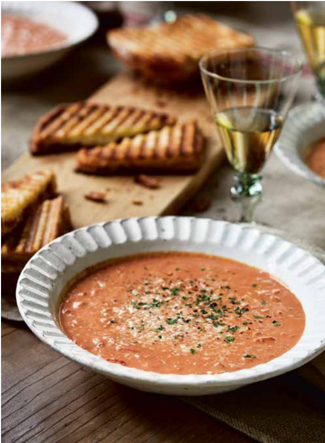
Creamy Tomato Bisque , Modern Comfort Food 83