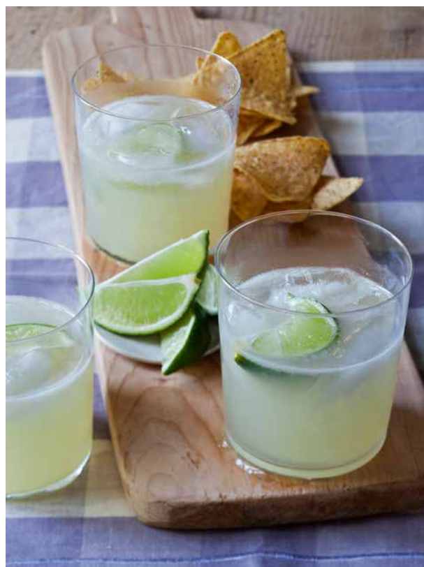
Jalapeño Margaritas, Make It Ahead 26

Fresh Lemonade, Barefoot Contessa Cookbook 32 Herbal Iced Tea, Family Style 68 Hot Chocolate, Barefoot Contessa Cookbook 225 Hot Mulled Cider, Parties! 239 Italian Iced Coffee, Cook Like a Pro 241 Mexican Hot Chocolate, Foolproof 251 Sunrise Smoothies, Back to Basics 224 The Perfect Cup of Coffee, Barefoot Contessa Cookbook 209 Tropical Smoothies, Parties! 39 Whipped Hot Chocolate, Family Style 210 Vanilla Cold-Brewed Iced Coffee, Modern Comfort Food 246 Vanilla Coffee Shakerato, Go-To Dinners 72 White Hot Chocolate, Barefoot Contessa Cookbook 226