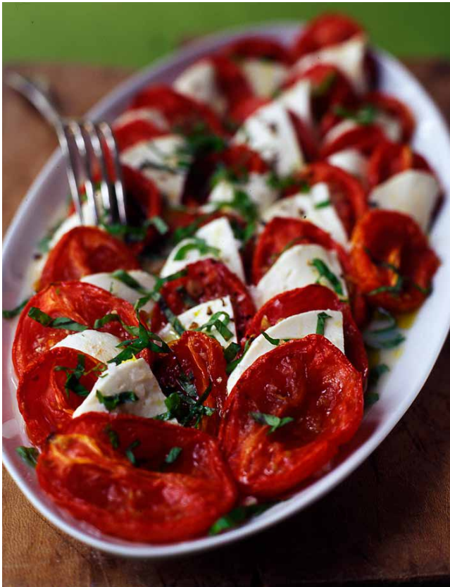
Roasted Tomato Caprese Salad, Back to Basics 90

Roasted Butternut Squash Salad with Warm Cider Vinaigrette, Back to Basics 88