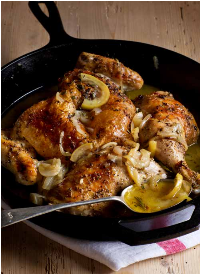
Skillet-Roasted Lemon Chicken, Cooking for Jeffrey 90

Creamy Chicken Thighs with Lemon & Thyme, Go-To Dinners 132 Crispy Chicken with Lemon Orzo, Modern Comfort Food 111 Crispy Mustard Chicken & Frisée, Cook Like a Pro 95 Crispy Mustard-Roasted Chicken, Foolproof 117 French Chicken Pot Pies, Make It Ahead 98 Fried Chicken Sandwiches, Cook Like a Pro 105 Herb-Roasted Turkey Breast, How Easy Is That? 127 Indonesian Ginger Chicken, Barefoot Contessa Cookbook 125 Jeffrey's Roast Chicken, How Easy Is That? 122 Lemon Chicken Breasts, How Easy Is That? 120 Lemon Chicken with Croutons, Barefoot in Paris 110 Make-Ahead Roast Turkey, Make It Ahead 101