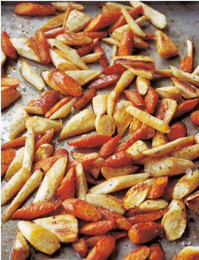
Roasted Parsnips & Carrots, Back to Basics 179

Roasted Fennel with Parmesan, Barefoot Contessa Cookbook 154 Roasted Parsnips & Carrots, Back to Basics 179 Roasted Pear & Apple Sauce, How Easy Is That? 192 Roasted Shishito Peppers with Easy Hollandaise, Modern Comfort Food 162 Roasted Summer Vegetables, How Easy Is That? 169 Roasted Tomatoes with Basil, Back to Basics 183 Roasted Vegetable Torte, Barefoot Contessa Cookbook 160 Roasted Vegetables, Barefoot Contessa Cookbook 166 Roasted Vine Tomatoes, Cooking for Jeffrey 137 Roasted Winter Vegetables, Family Style 110 Root Vegetable Gratin, Cooking for Jeffrey 138 Sagaponack Corn Pudding, Family Style 128 Sausage-Stuffed Mushrooms, How Easy Is That? 184