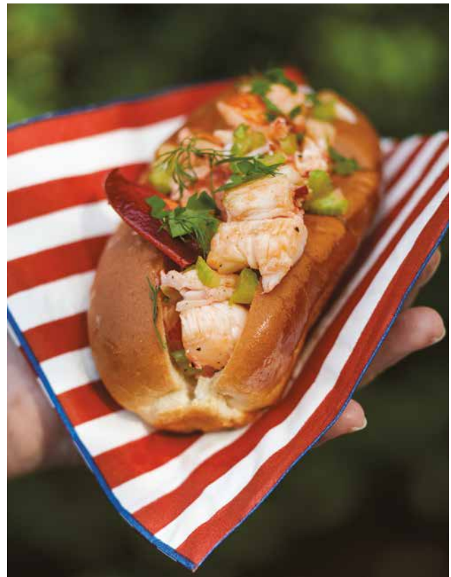
Warm Lobster Rolls, Cook Like a Pro 136

Garlic & Herb Roasted Shrimp, Make It Ahead 140 Grilled Herb Shrimp with Mango Salsa, Parties! 138 Grilled Tuna Niçoise Platter, Barefoot Contessa Cookbook 140 Herb-Roasted Fish, Make It Ahead 131 Hot Smoked Salmon with Fresh Dill Sauce, Foolproof 83 Indonesian Grilled Swordfish, Back to Basics 135 Kitchen Clambake, Barefoot Contessa Cookbook 126 Lobster Potpie, Barefoot Contessa Cookbook 132 Mussels in White Wine, Barefoot in Paris 68 Mussels with Saffron Cream, Go-To Dinners 154 Mustard-Roasted Fish, Back to Basics 136 Oven-Roasted Southern “Shrimp Boil,” Go-To Dinners 149 Panko-Crusted Salmon, How Easy Is That? 152 Parker’s Fish & Chips with Baked “Chips,” Family Style 97 Perfect Poached Lobster, Cook Like a Pro 263 Perfect Poached Lobster & Corn with Tarragon Butter, Cooking for Jeffrey 117 Prosciutto Roasted Bass with Autumn Vegetables, Back to Basics 141 Provençal Fish Stew with Sriracha Rouille, Make It Ahead 137 Roasted Salmon Tacos, Cooking for Jeffrey 118 Roasted Salmon with Green Herbs, How Easy Is That? 149 Roasted Shrimp with Feta, How Easy Is That? 146 Roasted Striped Bass, Barefoot in Paris 134 Salmon & Melting Cherry Tomatoes, Foolproof 150 Salmon Teriyaki & Broccolini, Go-To Dinners 150 Salmon with Fennel, Barefoot Contessa Cookbook 134 Salmon with Lentils, Barefoot in Paris 136 Scallops Provençal, Barefoot in Paris 135 Seafood Gratin, At Home 116 Seafood Platter with Mustard, Cocktail, and Mignonette Sauce, Barefoot in Paris 70