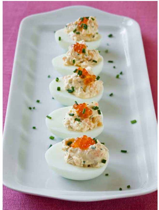
Smoked Salmon Deviled Eggs, How Easy Is That? 26

Antipasto Board, Go-To Dinners 45 Bay Scallop Ceviche, Cook Like a Pro 27 Blini with Smoked Salmon, Barefoot in Paris 33 Buffalo Chicken Wings, Family Style 36 Caramelized Bacon, Foolproof 31 Caviar Dip, Parties! 78 Chopped Liver, Parties! 58 Crab Cakes with Rémoulade Sauce, Barefoot Contessa Cookbook 44 Crab Strudels, Foolproof 34 Crostinis with Tuna Tapenade, How Easy Is That? 47 Easy Oysters Rockefeller, Go-To Dinners 38 Filet of Beef Carpaccio, Cook Like a Pro 73 Foie Gras with Roasted Apples, How Easy Is That? 78 Fresh Crab Nachos, Modern Comfort Food 44 Fresh Salmon Tartare, How Easy Is That? 77 Fried Oysters with Lemon Saffron Aioli, Cooking for Jeffrey 30 Gravlax with Mustard Sauce, Back to Basics 34 Grilled Lemon Chicken with Satay Dip, Barefoot Contessa Cookbook 48 Grilled Oysters with Lemon Dill Butter, Modern Comfort Food 48 Kielbasa with Mustard Dip, Modern Comfort Food 52 Lamb Sausage in Puff Pastry, Barefoot Contessa Cookbook 42 Lobster Corn Fritters, Foolproof 90 Lobster Salad in Endive, Barefoot Contessa Cookbook 43 Mussels & Basil Bread Crumbs, How Easy Is That? 80 Mussels with Saffron Mayonnaise, Foolproof 71 Potato Galettes with Smoked Salmon, Modern Comfort Food 39 Potato Pancakes with Caviar, Parties! 169 Roasted Figs & Prosciutto, How Easy Is That? 28 Roasted Shrimp Cocktail, Back to Basics 38