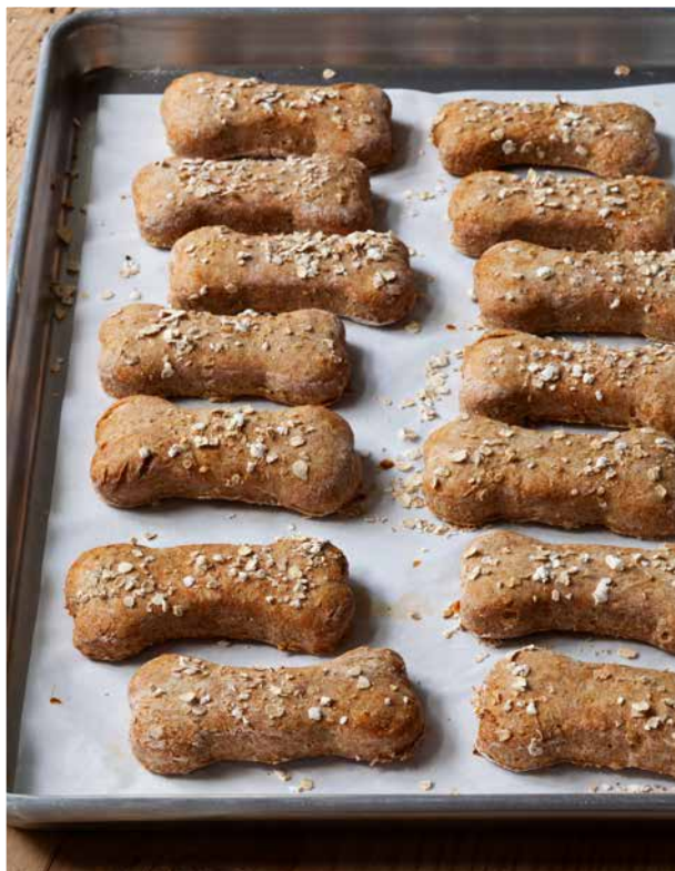
Whole Wheat Peanut Butter Dog Biscuits, Make It Ahead 18

© copyright 2023 by Ina Garten All rights reserved.