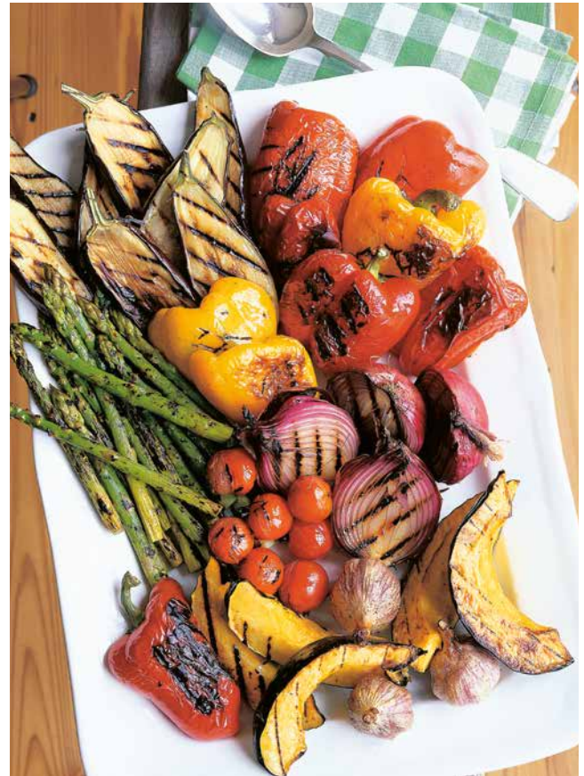
Grilled Vegetables, Barefoot Contessa Cookbook 166

Roasted Beets, Barefoot in Paris 150 Roasted Broccolini & Cheddar, Modern Comfort Food 150 Roasted Broccoli with Panko Gremolata, Cook Like a Pro 164 Roasted Broccolini, Cooking for Jeffrey 162 Roasted Brussels Sprouts, Barefoot Contessa Cookbook 150 Roasted Butternut Squash, How Easy Is That? 177 Roasted Butternut Squash with Brown Butter & Sage, Modern Comfort Food 158 Roasted Carrots, Barefoot Contessa Cookbook 149 Roasted Cauliflower with Lemon & Capers, Modern Comfort Food 154 Roasted Cauliflower Snowflakes, Make It Ahead 170 Roasted Cherry Tomatoes, Parties! 85