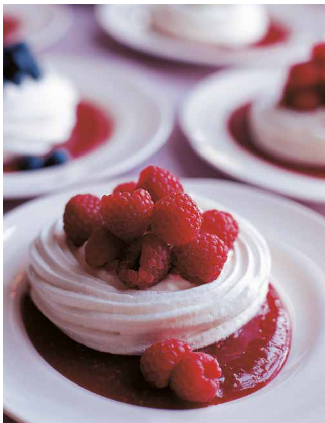
Meringues Chantilly, Barefoot in Paris 176

Fresh Raspberry Gratin, Back to Basics 210 Fresh Raspberry Sauce, Cook Like a Pro 265 Frozen Berries with Hot White Chocolate, At Home 162 Frozen Hot Chocolate, Cooking for Jeffrey 240 Frozen Mocha Mousse, Cooking for Jeffrey 218 Fruit Juice Shapes, Family Style 206 Honey Vanilla Crème Fraîche, Barefoot Contessa Cookbook 198 Honey Vanilla Fromage Blanc with Raspberry Sauce, Back to Basics 206 Île Flottante, Barefoot in Paris 180 Lime Curd, Parties! 203 Make-Ahead Whipped Cream, Make It Ahead 197 Make-Ahead Zabaglione with Amaretti, Make It Ahead 225