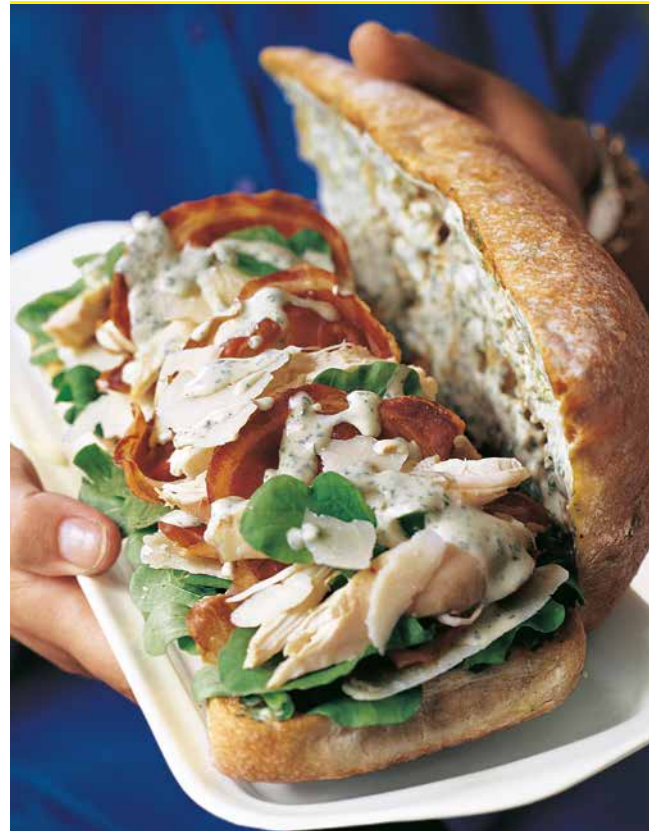
Caesar Club Sandwich, At Home 32