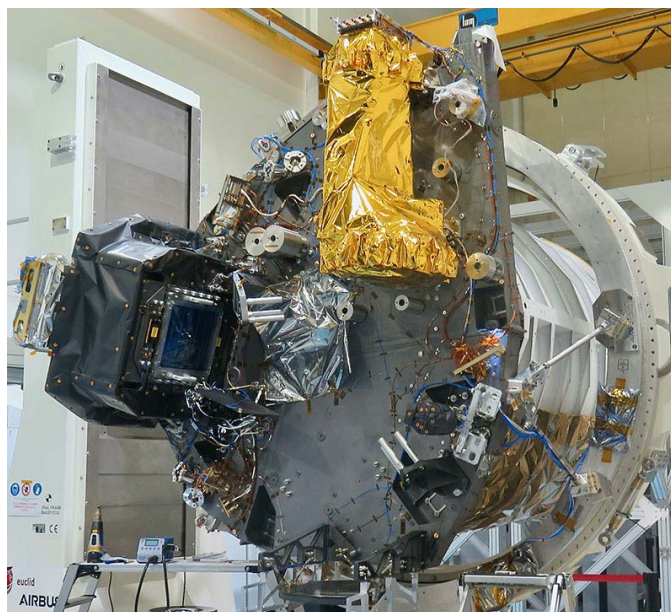
The Structural and Thermal Model of ESA's Euclid mission's payload module seen in the clean room, with part of the VIS (covered in black Multi-Layer Insulation (MLI) and NISP (gold MLI) instruments installed.

Euclid is an ESA mission with important NASA contributions. An international group of scientists and engineers known as the Euclid Consortium, with participation from NASA, provide the scientific instruments, data, and analysis for the mission.