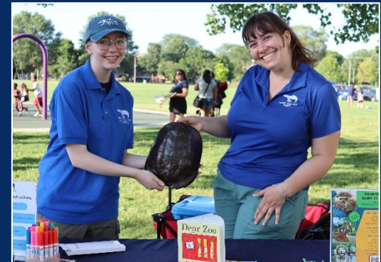
Henry Vilas Zoo Outreach Table