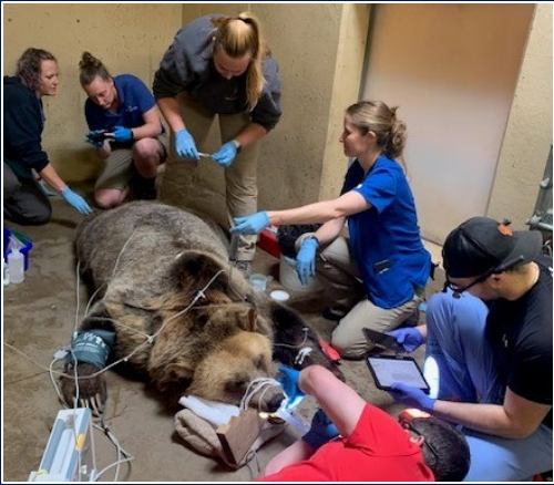
Grizzly Bear Procedure