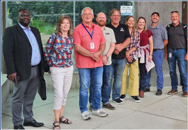
Public Works & Transportation Committee Meeting 8/20/24