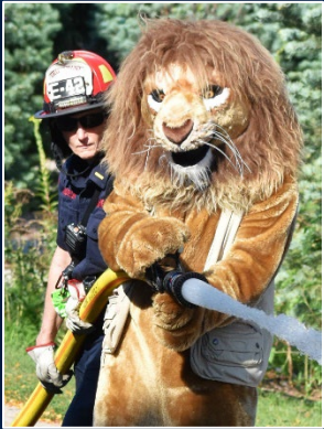
Zoo mascot helping promote MFD Zoo Takeover Event