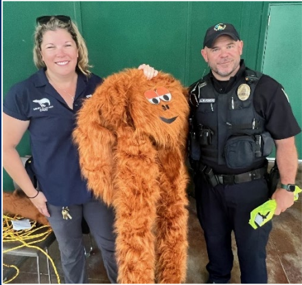
Escaped Animal Drill Coordinated with MPD 8/28/24