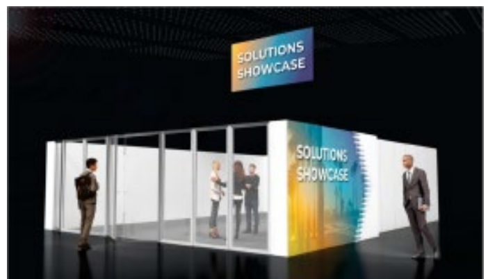
Mock-up of VDC Showcase