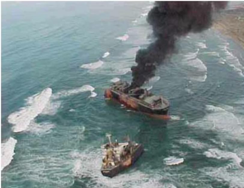
Smoke rising from the New Carissa, February 1999.

U.S. Coast Guard National Oceanic and Atmospheric Administration U.S. Environmental Protection Agency Centers for Disease Control and Prevention Minerals Management Service