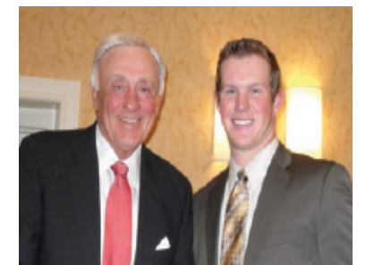
Craig Kimbrel, right, with Phil Niekro former Braves pitcher.