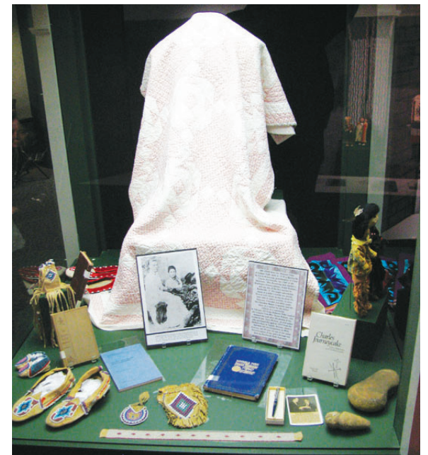
Quilt is on display at the Bartlesville History Museum, 401 S. Johnstone, Bartlesville, OK.

The quilt will be on display at Bartlesville History Museum and will have showings at the Nowata History Museum.