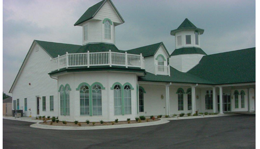
Bright Beginnings a new child development center in Claremore, OK