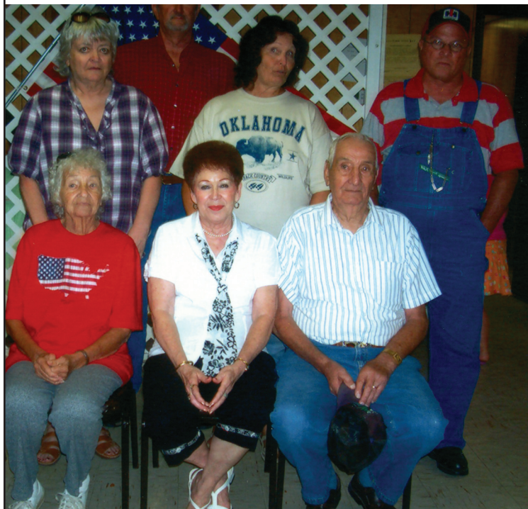
Adair Family group, left.