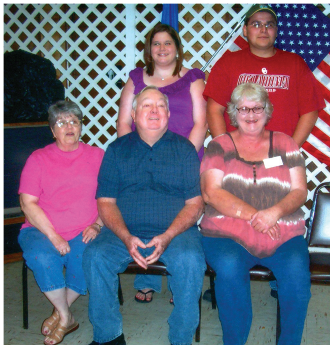
Hayes Family group upper right.