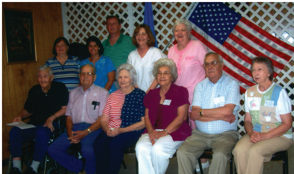
Douglas Family group Right.